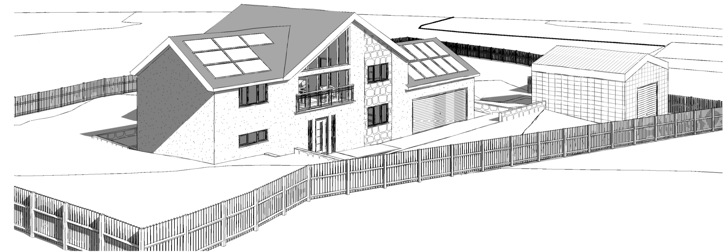
4 3D View 4