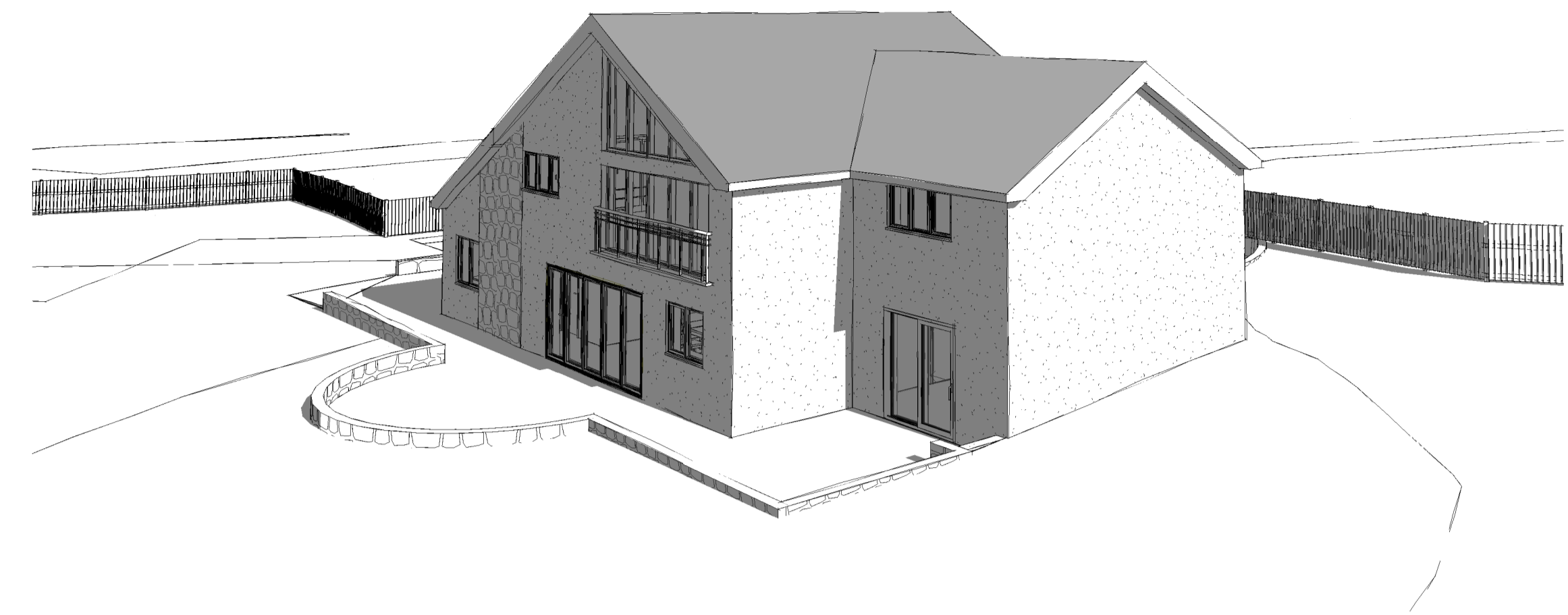
2 3D View 2