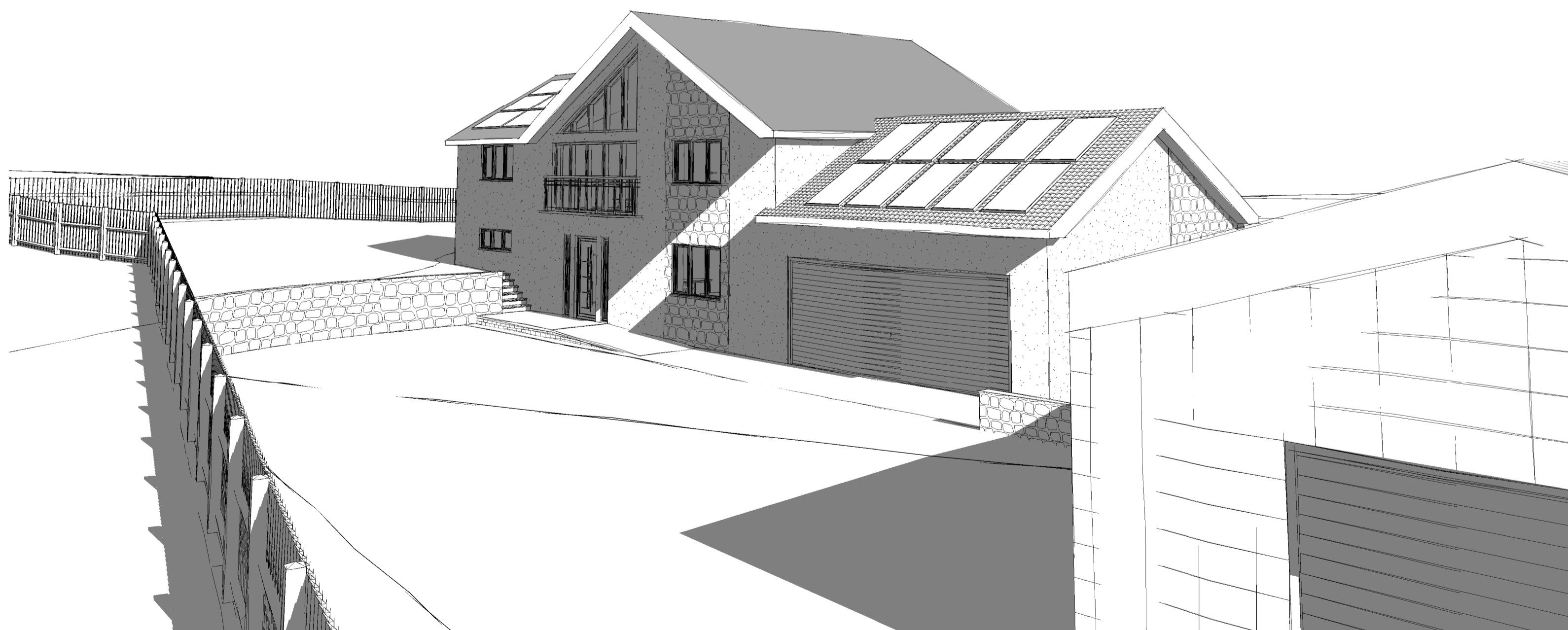
3 3D View 3