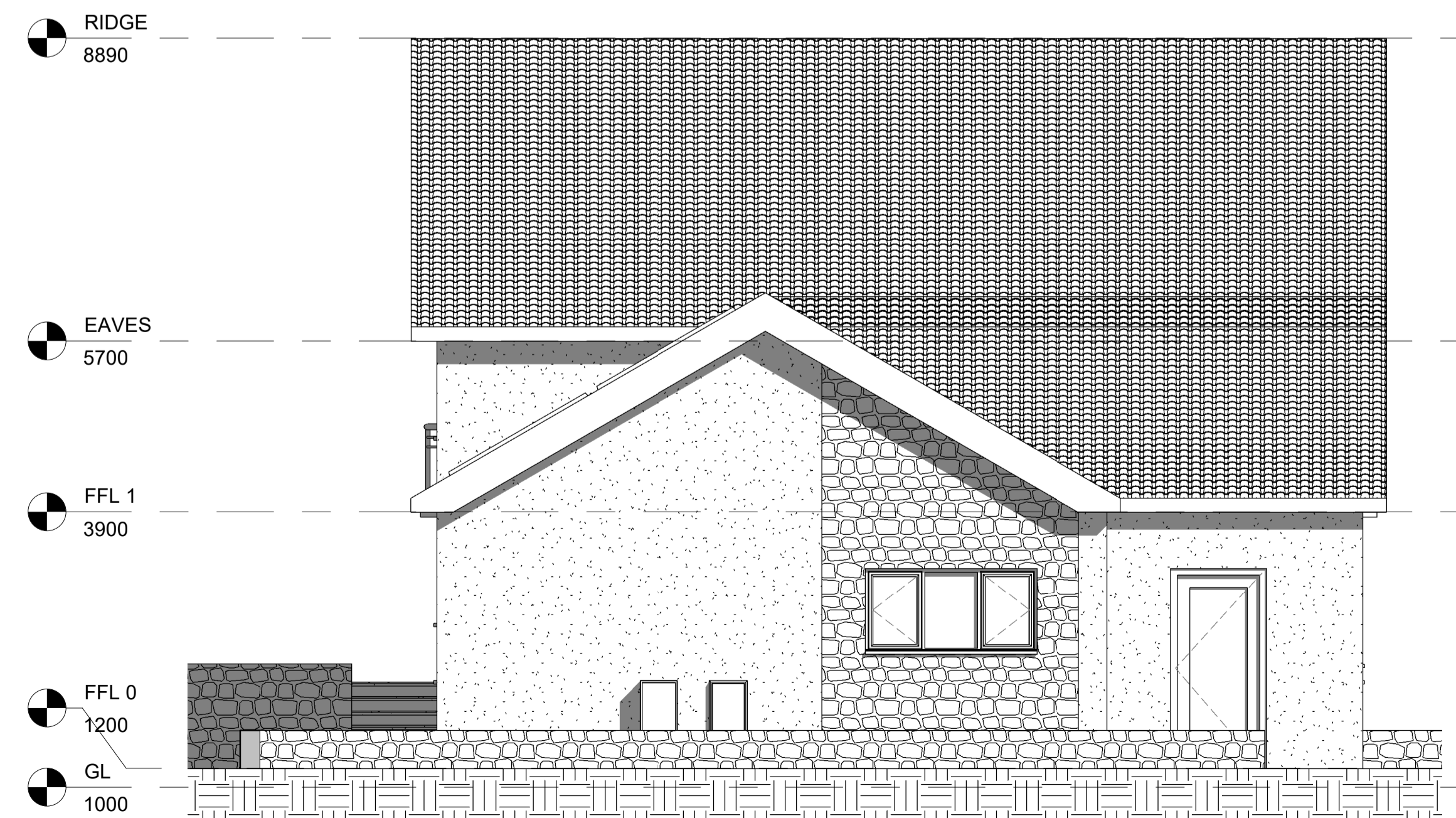
4 North East 1 : 50

WORK IN PROGRESS DRAWING This drawing is not intended to be used for contract pricing or fabrication purposes. All content is subject to change.