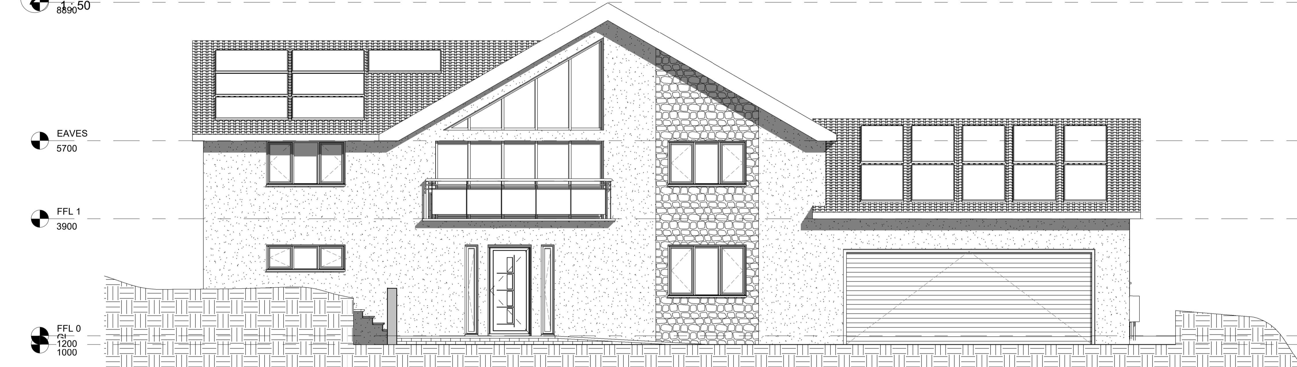
3 South East 1 : 50