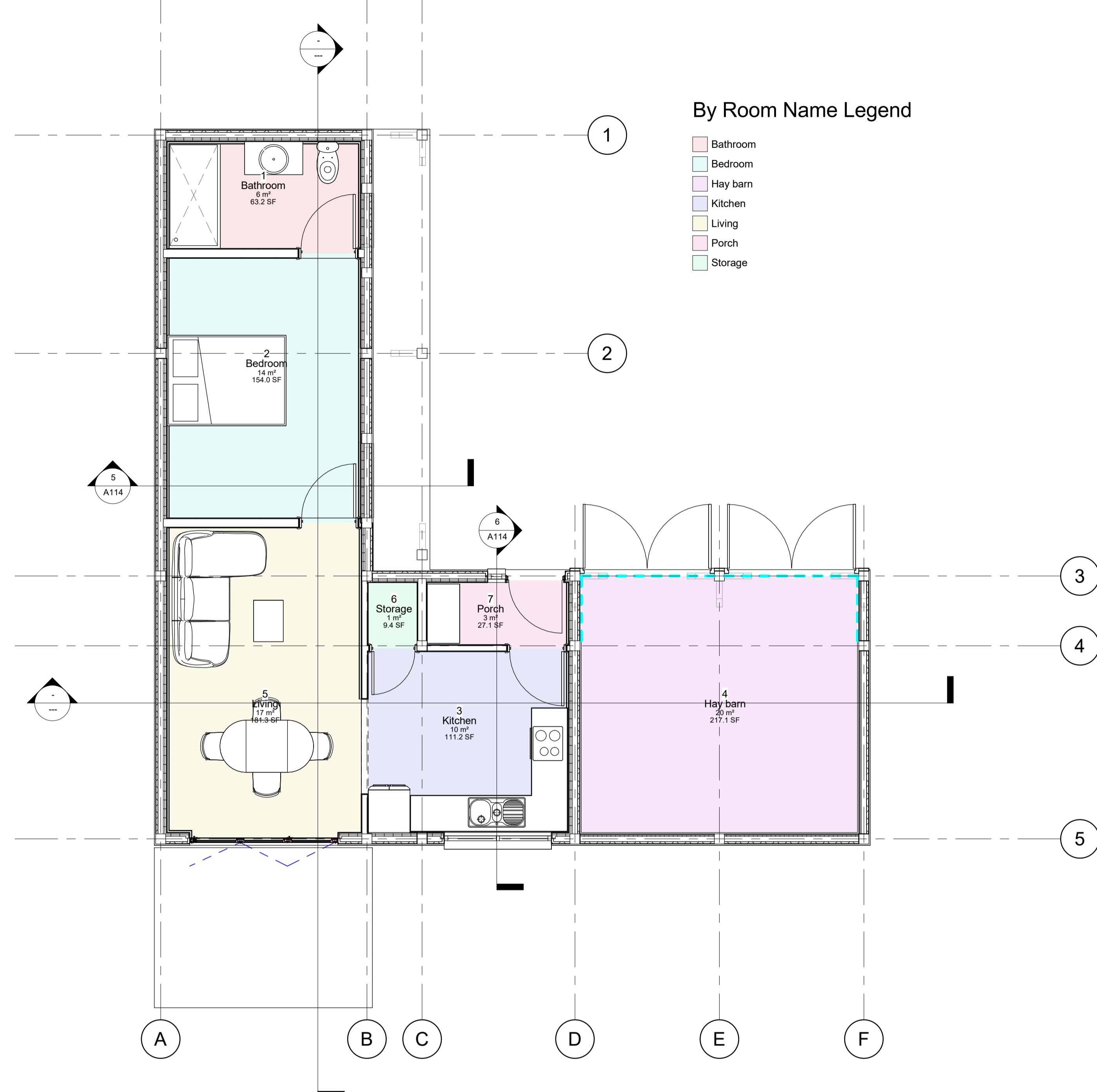
1 Level 0 GA 1 : 50