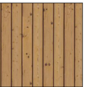
Vertical timber cladding