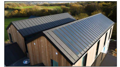
Proposed zinc walls and roof with integrated solar panels on south facing roof area