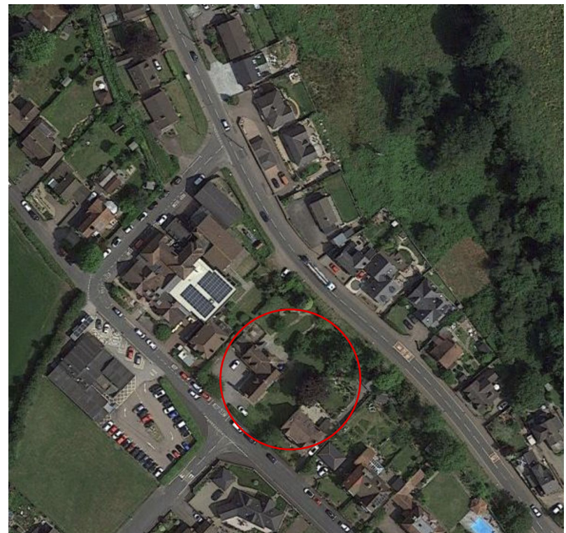
2 Satellite View Scale: N/A