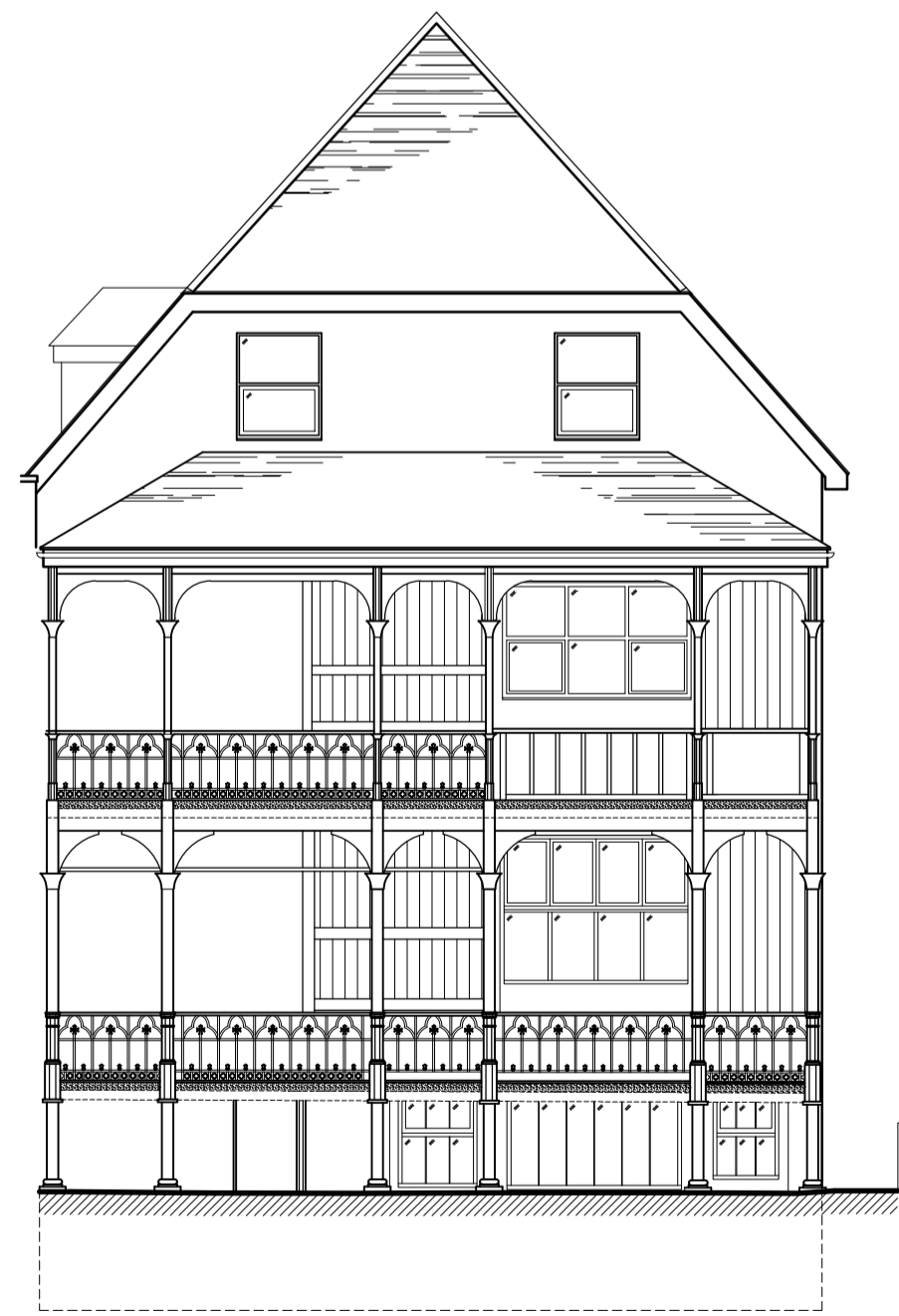
PART SOUTH ELEVATION AS EXISTING 1:100

Existing Materials:- Roof - Tiled roof Main Walls - Natural Stone with buff brick detailing Windows & Doors - mixture of timber & UPVC white Vertical boarding - timber Railings & support work - Cast Iron