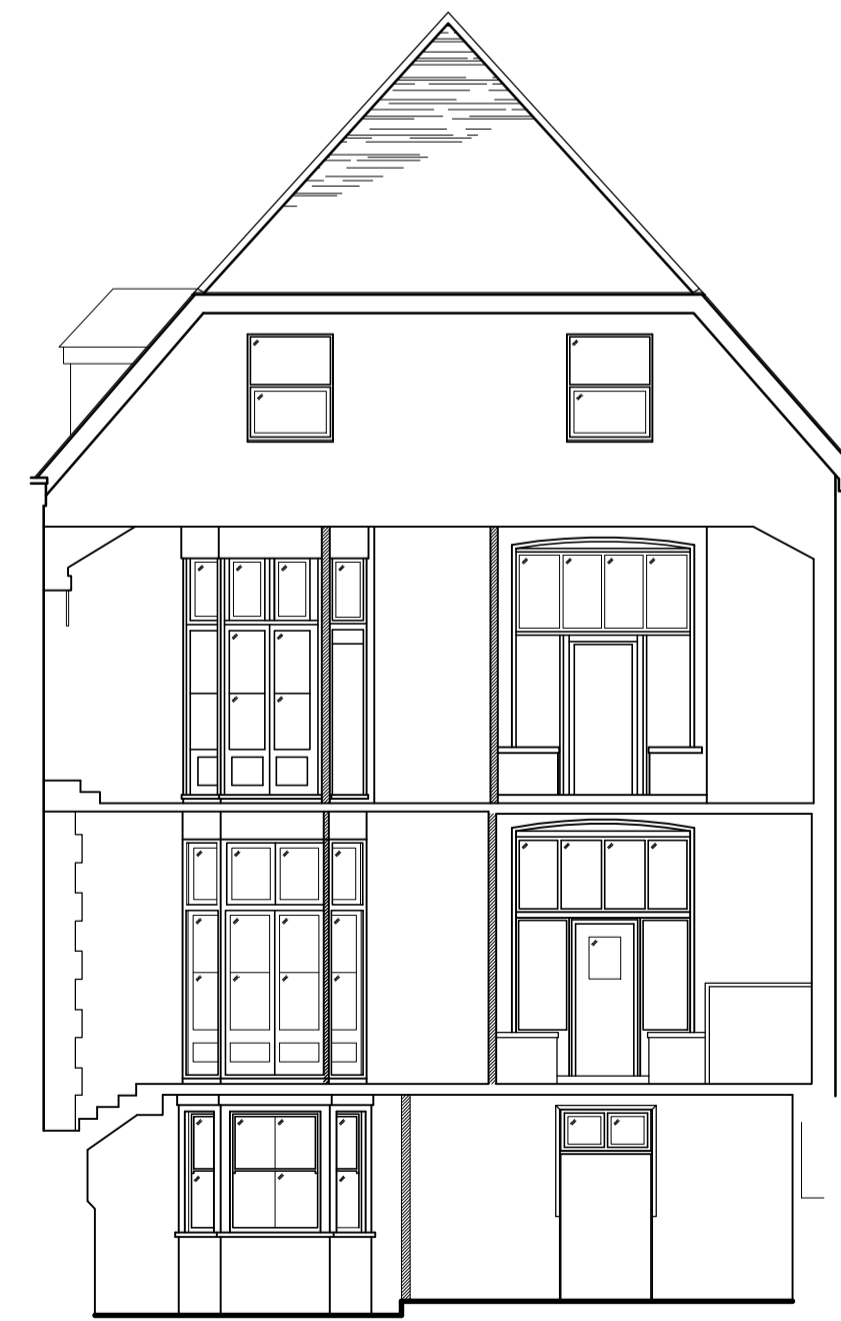
PART SOUTH ELEVATION AS EXISTING 1:100 (stripped back to existing stone wall)