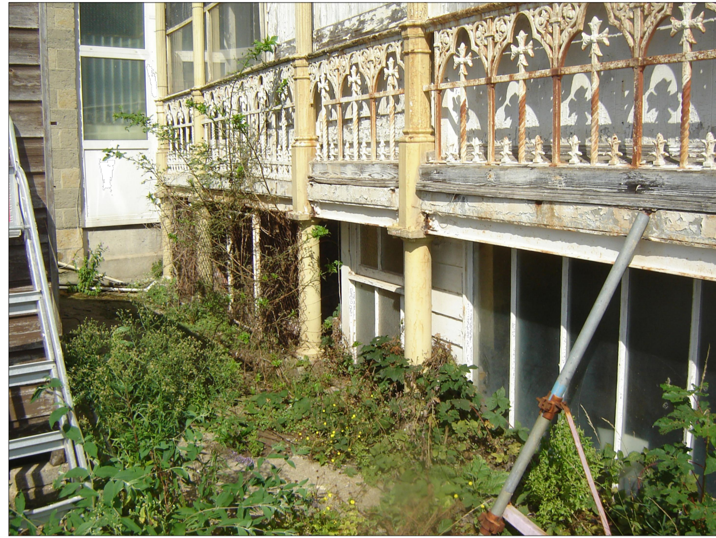
Photo 1 (refer to floor plan drg No BDS273D / 100 for location key)