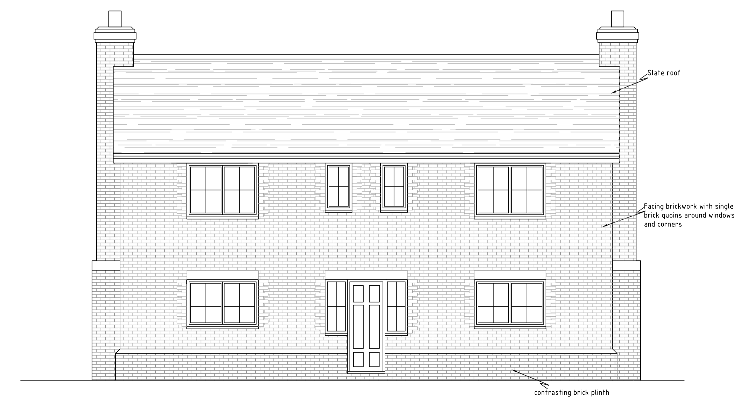
Rear Elevation Scale 1:50@ A1