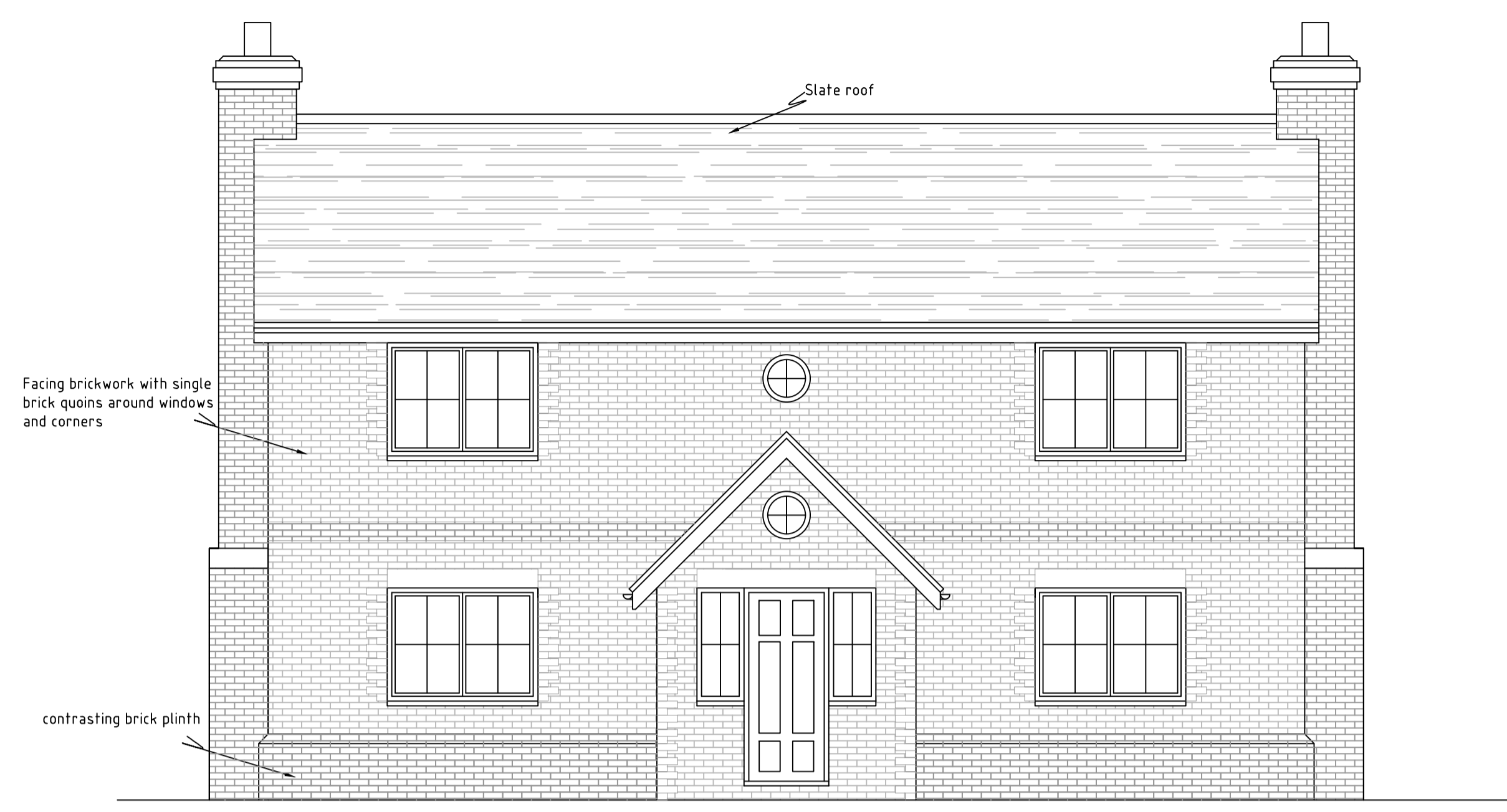
Front Elevation Scale 1:50@ A1