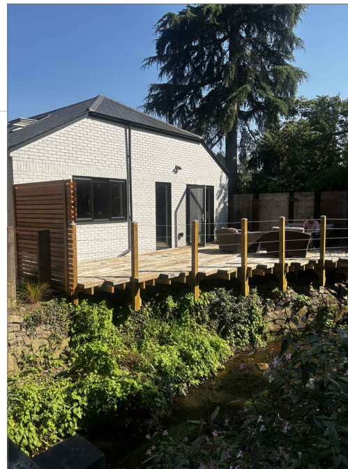
Photograph 3 Viewing of decked terrace from public foot bridge.