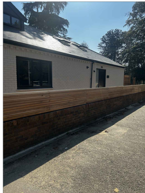
Photograph 2 Installed 0.53m fencing on existing boundary wall.