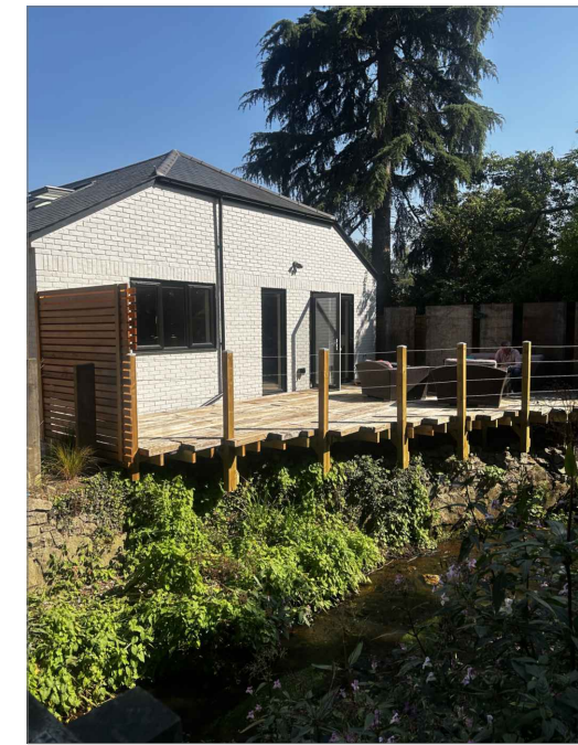
Photograph 2 Installed decking area to flank of building elevation.