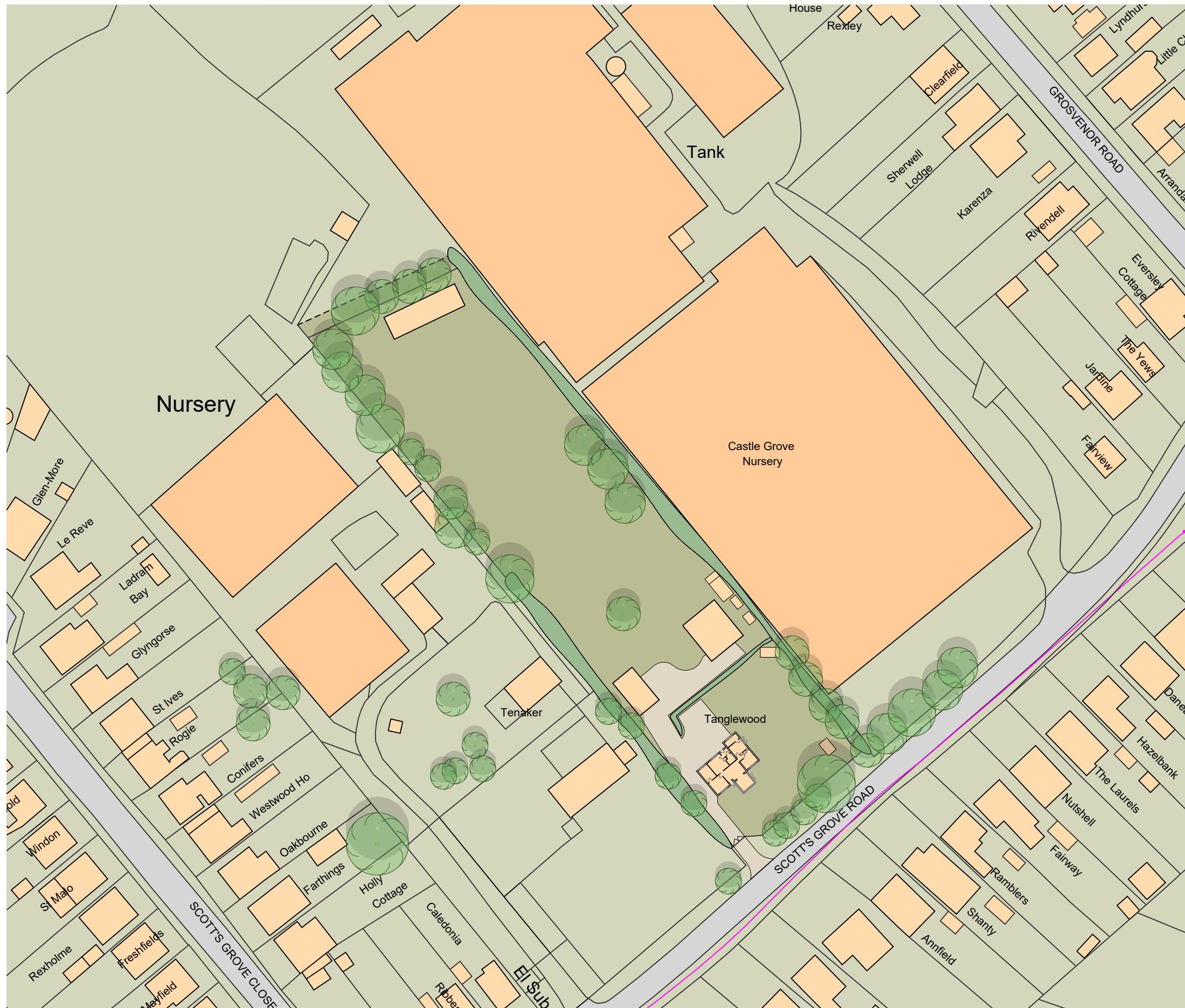
As Existing Site Plan