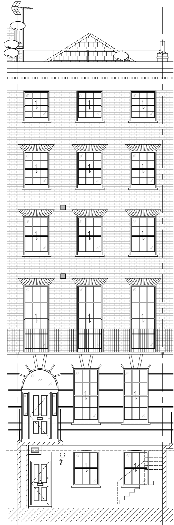
57 Great Cumberland Place - Existing Front Elevation Scale 1:50 @ A1

NOTES The contractor is responsible to ensure no products are to be utilised that do not comply with relevant British and / or European Standards and / or Codes of Practice, CoSHH Regulations, Construction Regulations, or which are known or suspected at the time of product selection and / or construction to be deleterious to health and safety or the durability of the work or not in accordance with good building practices. The contractor is responsible for checking dimensions, tolerances, levels and references. This drawing is to be read in conjunction with all relevant consultants or specialist drawings. Any discrepancy to be notified to MDB Associates and rectified before proceeding with the works on site or shop drawings. Where an item is covered by drawings to different scales, the larger scale drawing is to be worked to. Do not scale from this drawing. Figured dimensions are to be worked to in all cases. Further dimensions are to be requested if required. This drawing and the copyrights and patents therein are the property of MDB Associates and may not be used or reproduced without consent.