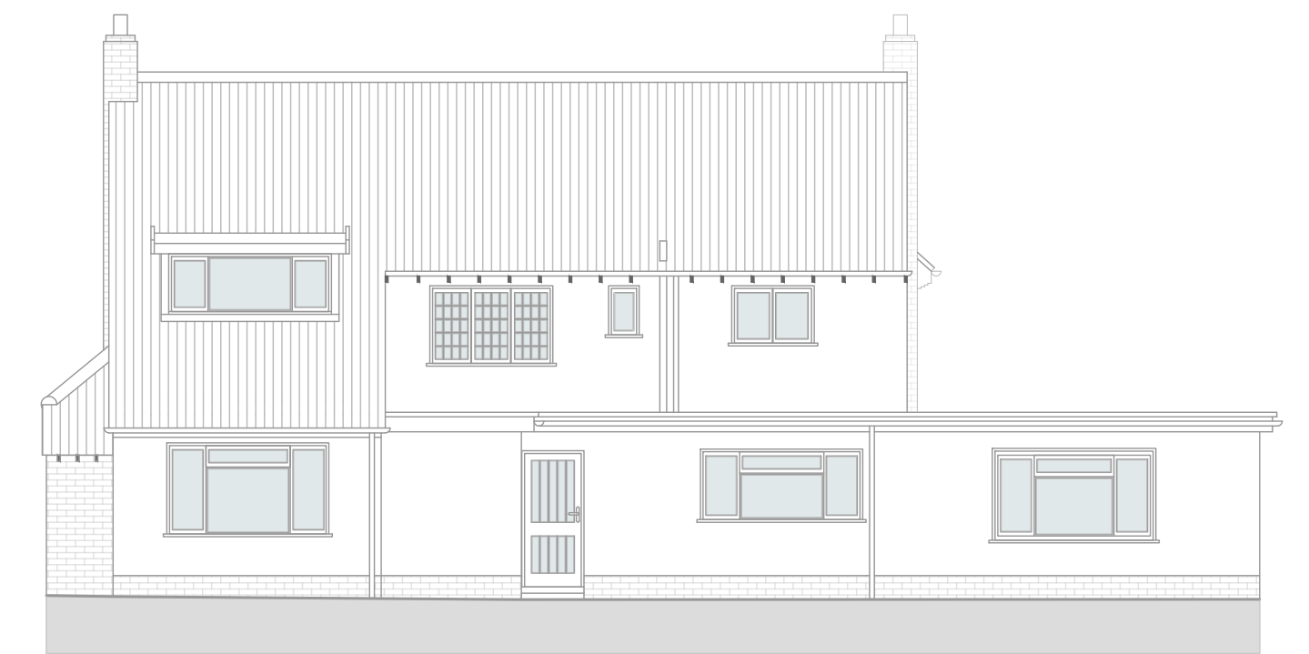
AS EXISTING REAR ELEVATION 1:100