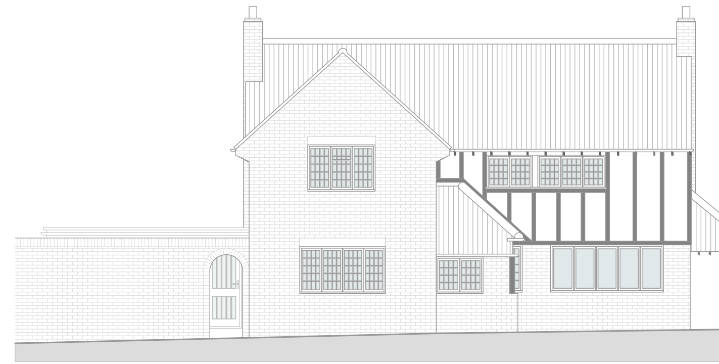
AS EXISTING FRONT ELEVATION 1:100