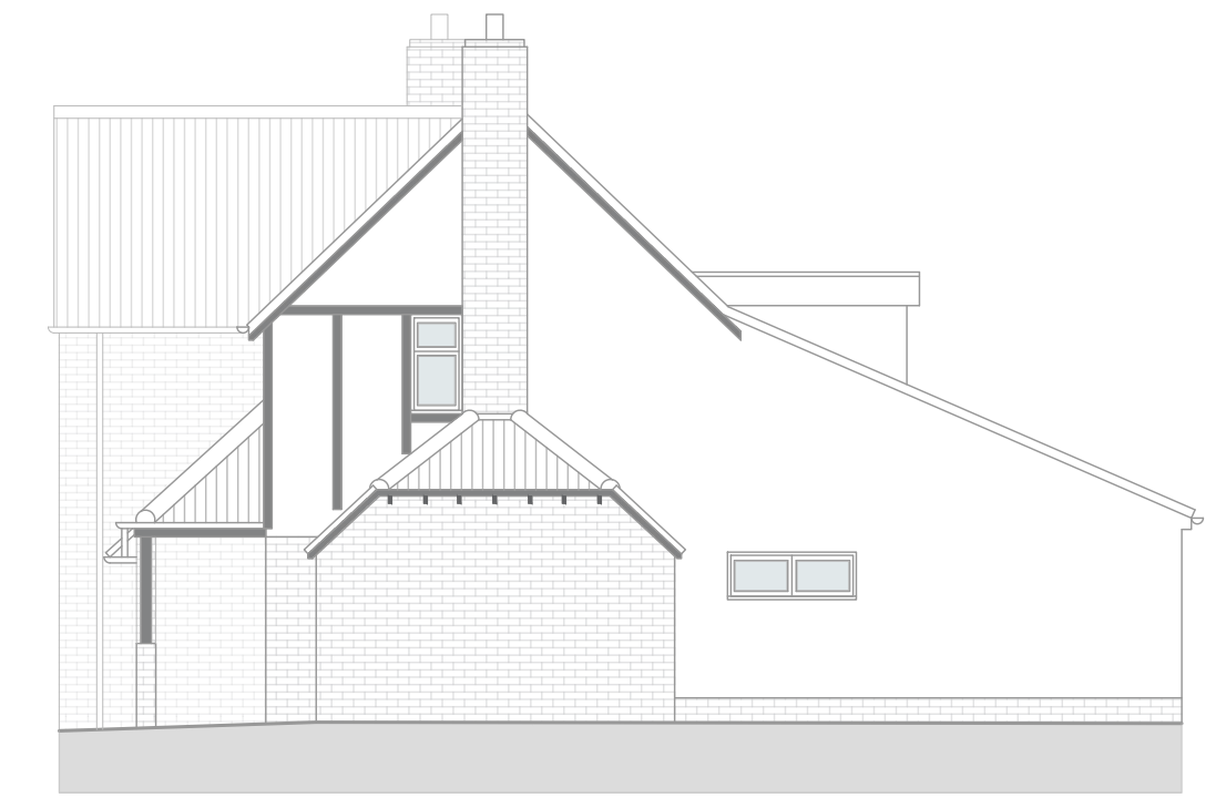
AS EXISTING SIDE ELEVATION 1:100