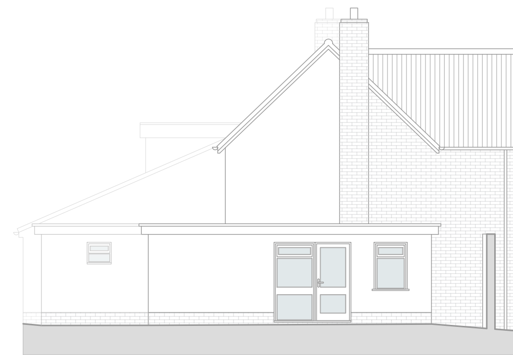
AS EXISTING SIDE ELEVATION 1:100