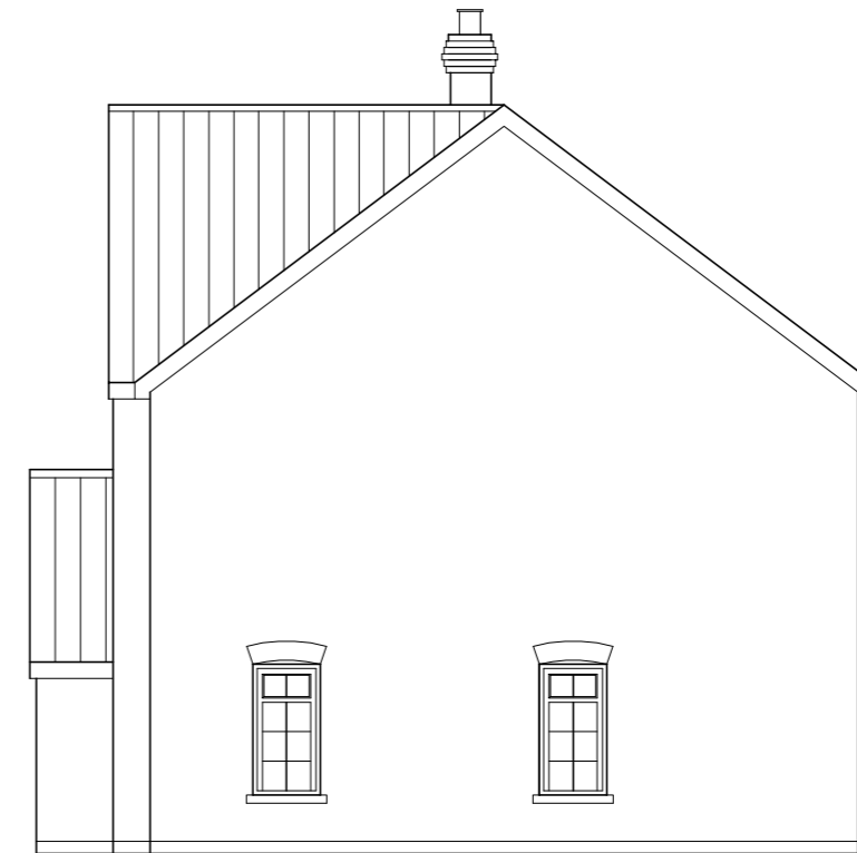
Right Side Elevation