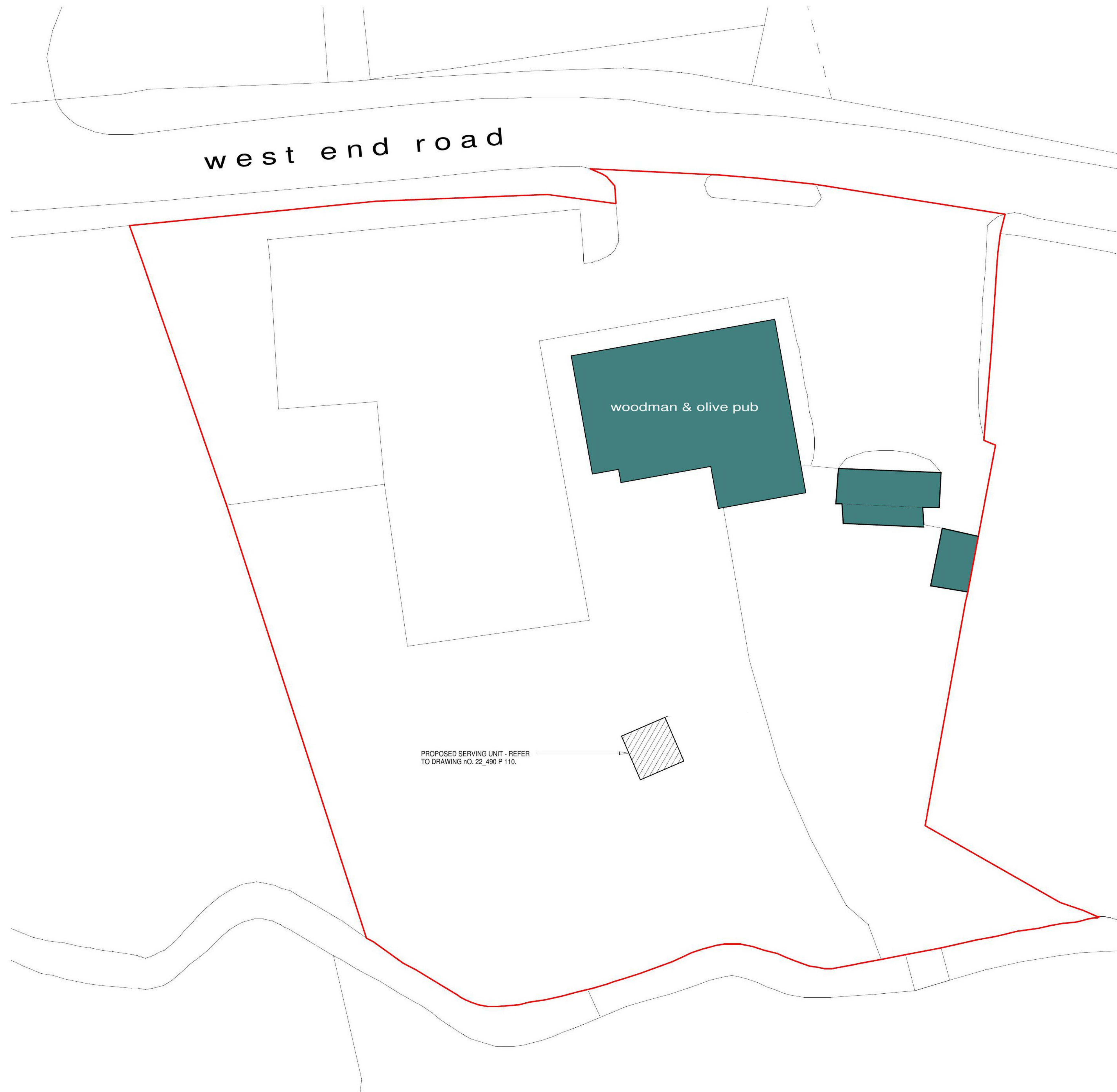
existing site plan 1:200