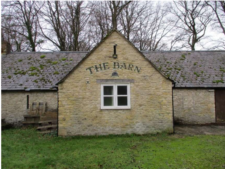
Photograph 4 – western end of north facing elevation with closed eaves, ridge and sealed openings