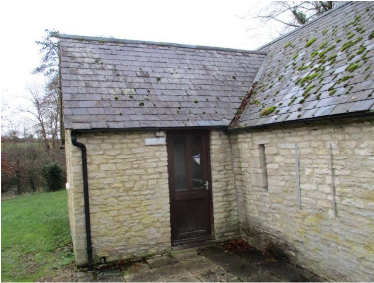
Photograph 6 – western gable end with eaves details all closed.