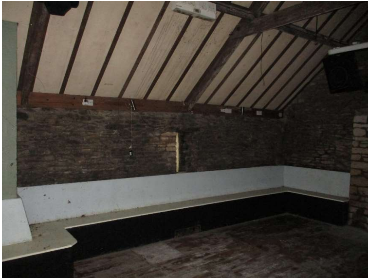
Photograph 10 – looking east, ceiling, eaves etc all closed, no voids.