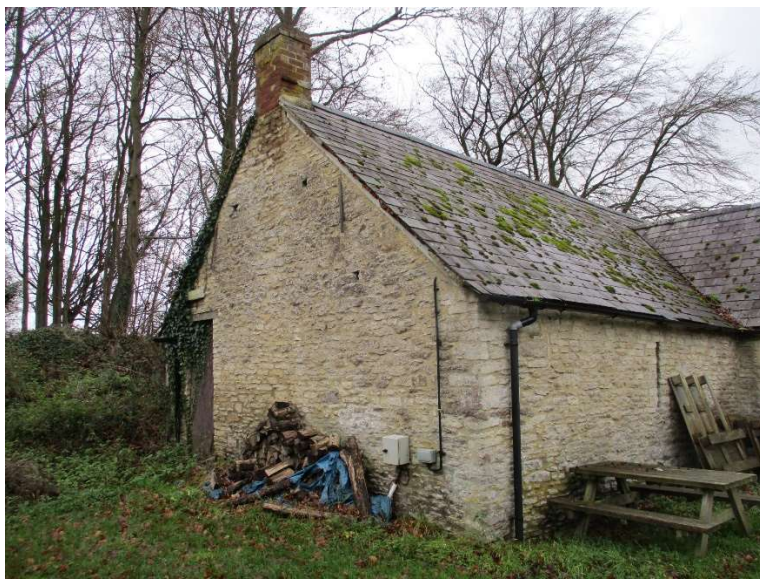
Photograph 2 – eastern end of north facing front elevation, fully tiled and hips close bedded