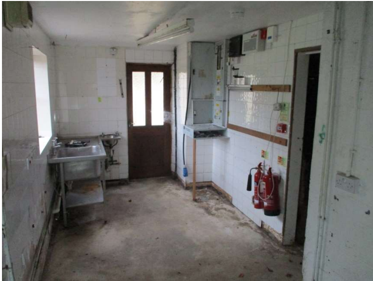
Photograph 8 - inside looking west, note ceilings closed, no roof void and no indication of bird or bat activity.