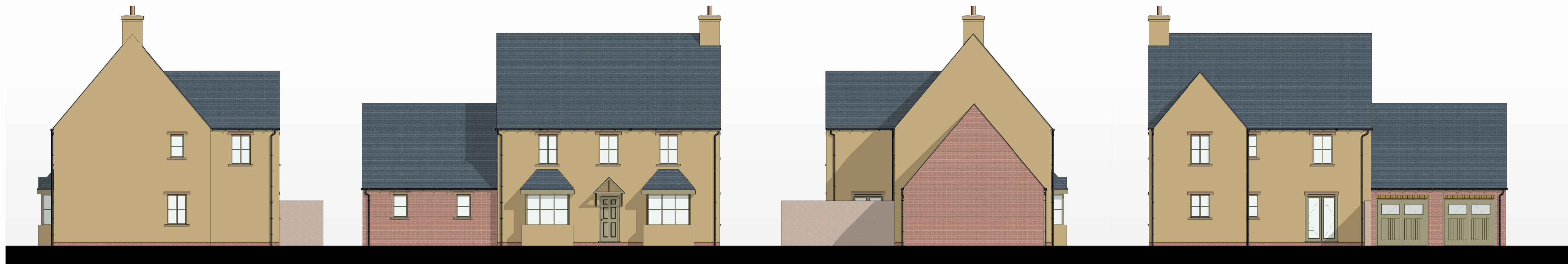
West Elevation 1 : 100