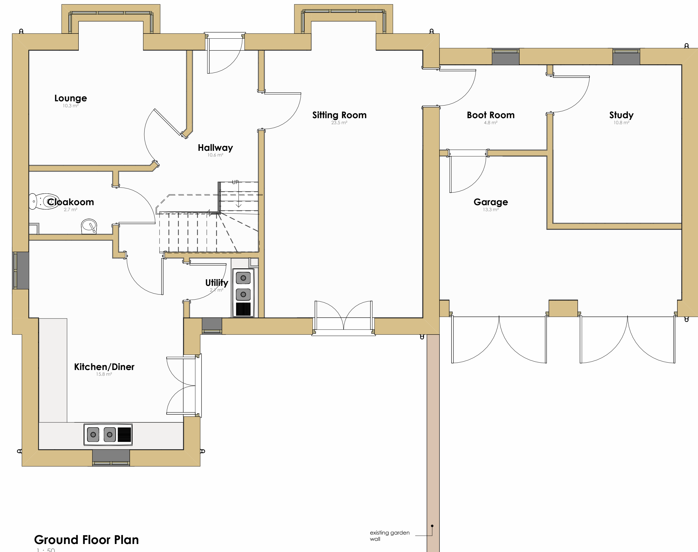
Ground Floor Plan 1 : 50