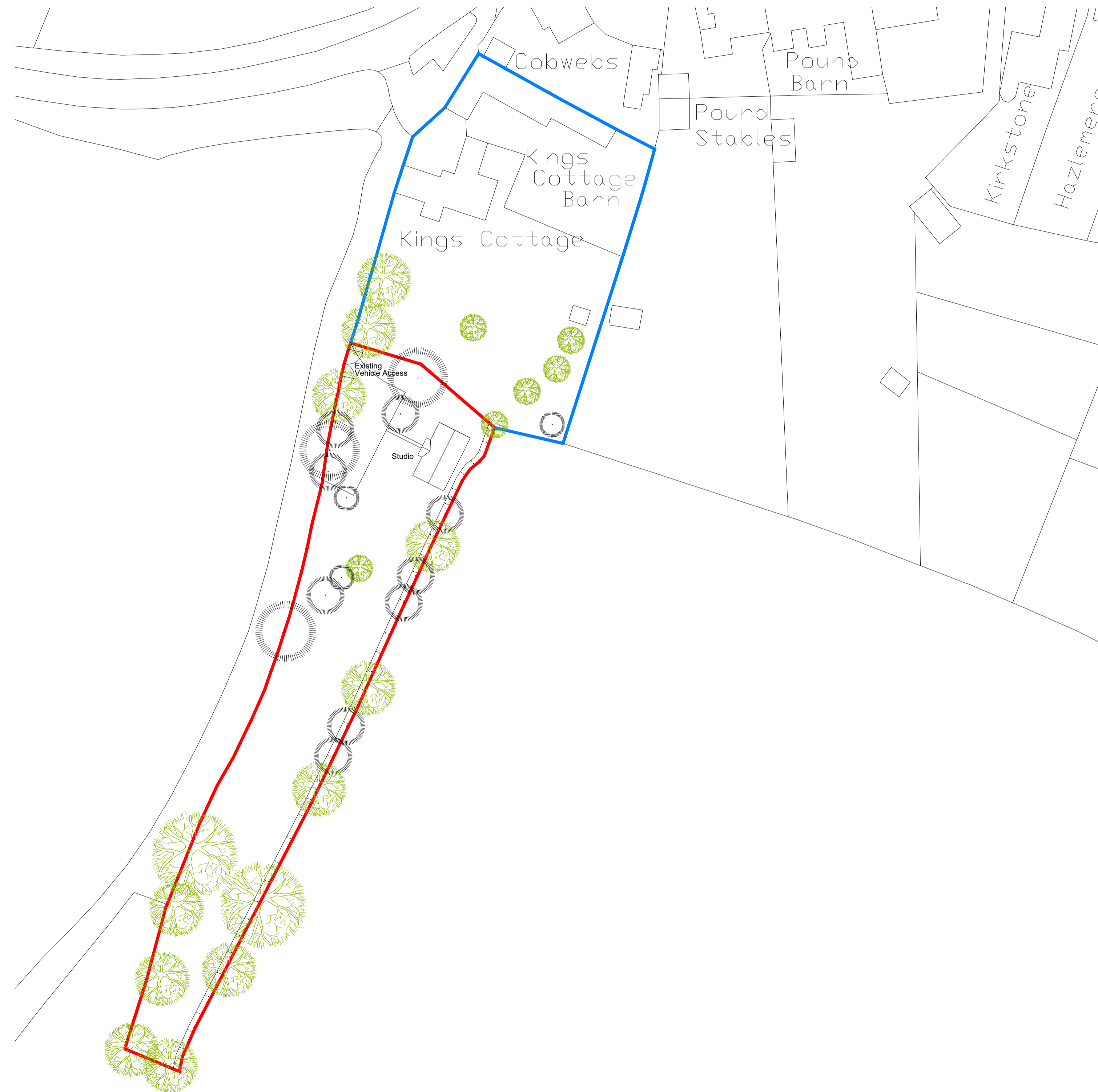
Site Plan Layout Scale 1:500

DO NOT SCALE FROM DRAWING. USE FIGURED DIMENSIONS ONLY. WHERE APPLICABLE, CHECK DIMENSIONS ON SITE PRIOR TO COMMENCEMENT OF WORKS.