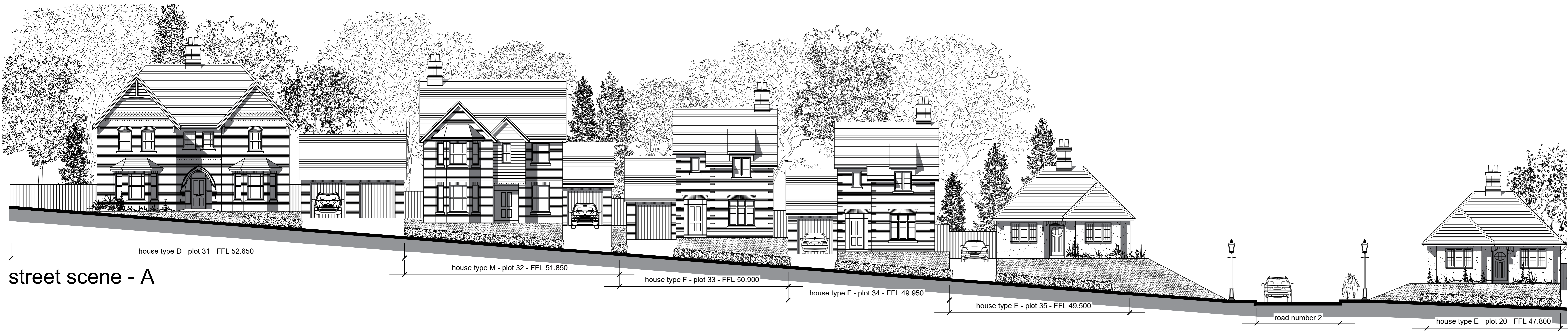
street scene - A