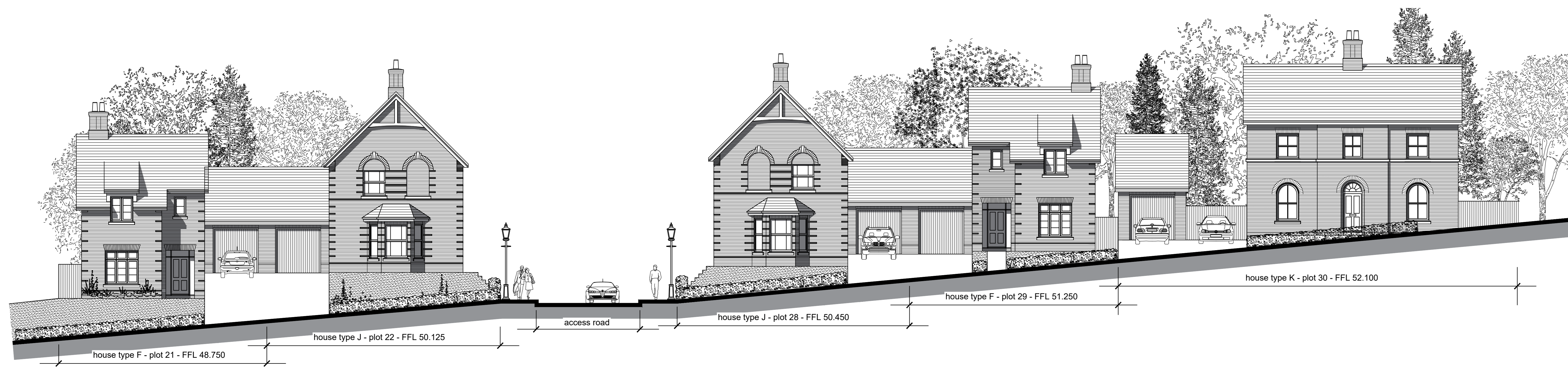
street scene - B