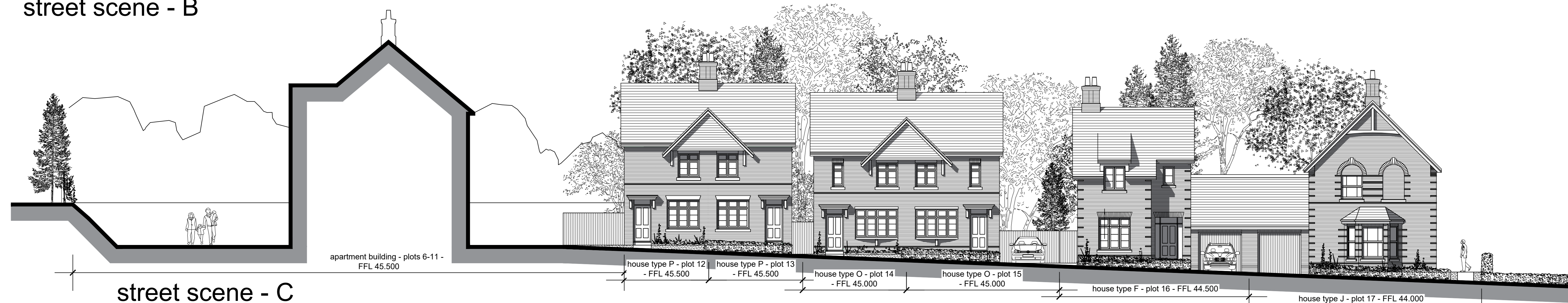
street scene - C