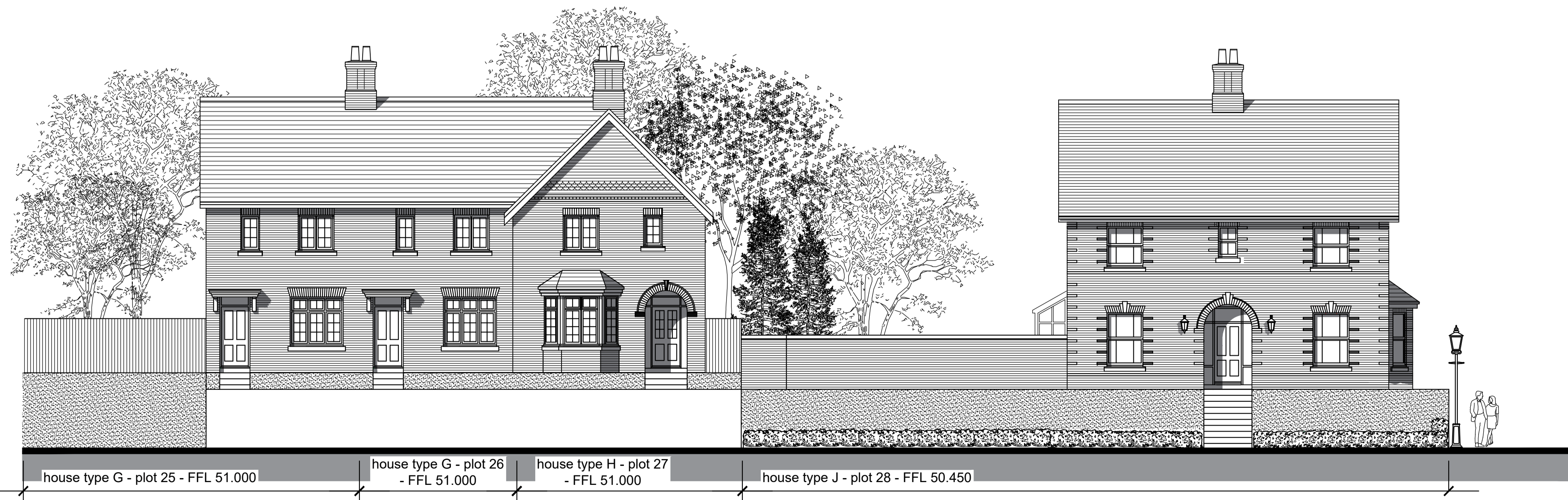
street scene - F