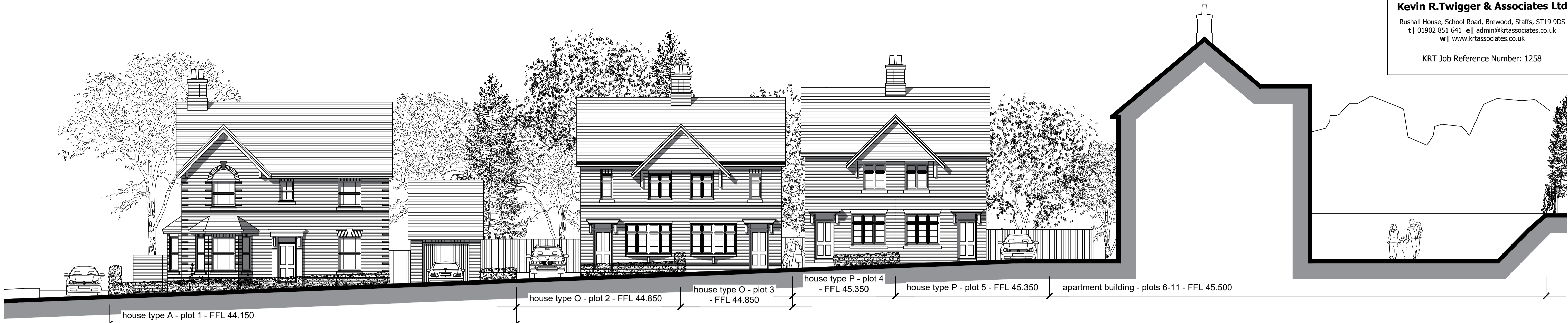
street scene - D