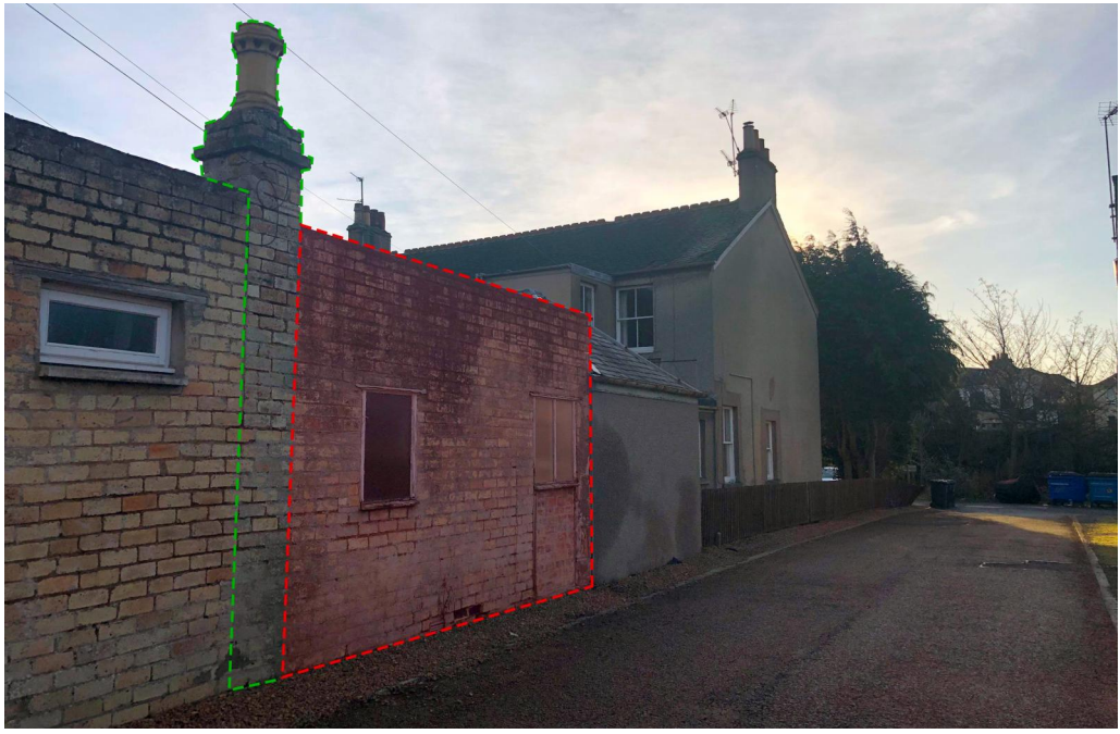
2 REAR ELEVATION 1:6.31