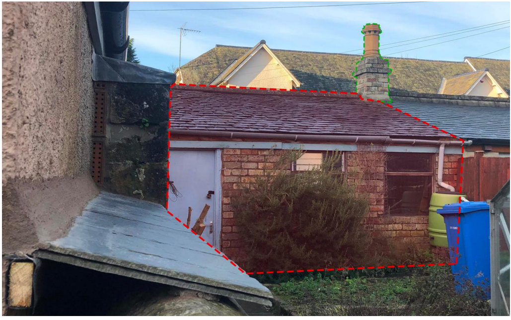
1 FRONT ELEVATION 1:4.73

COPYRIGHT OF MUIR WALKER & PRIDE. VERIFY ALL DIMENSIONS AND LEVELS. DRAWING PREPARED FOR OBTAINING CONSENTS ONLY; NOT TO BE USED FOR CONSTRUCTION PURPOSES.