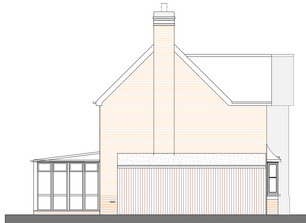
Existing Side East Elevation