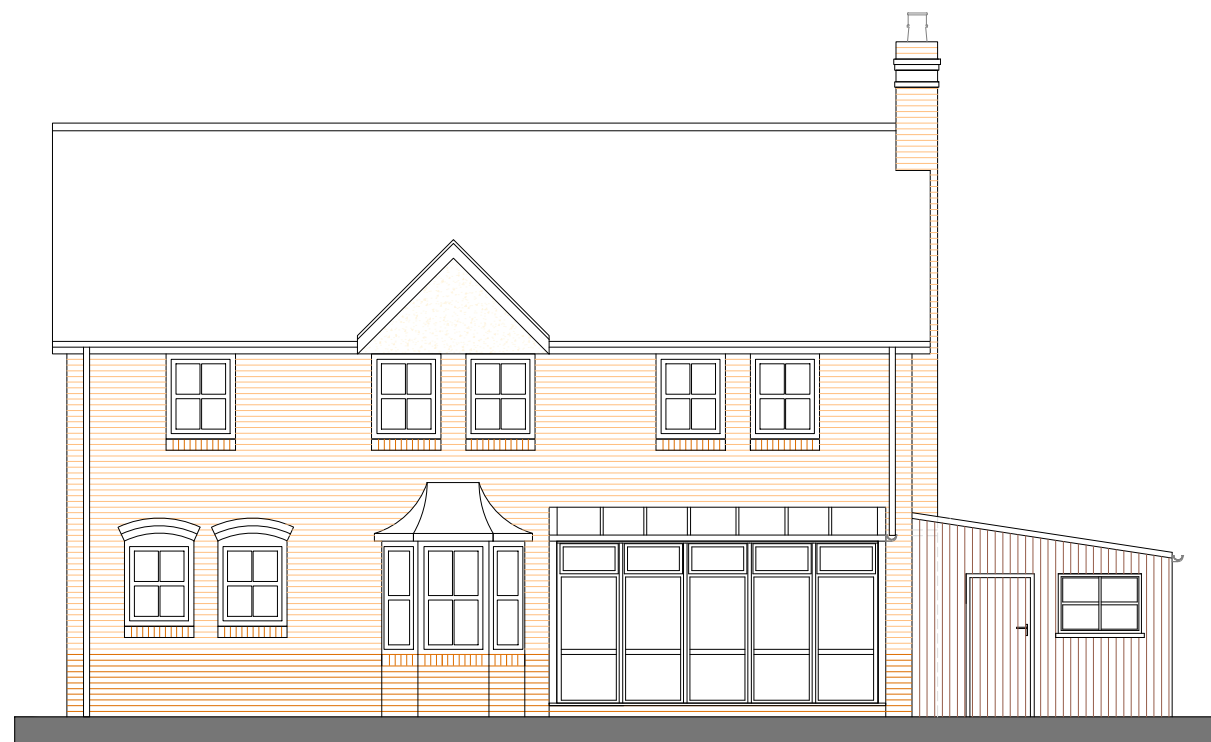
Existing Rear South Elevation