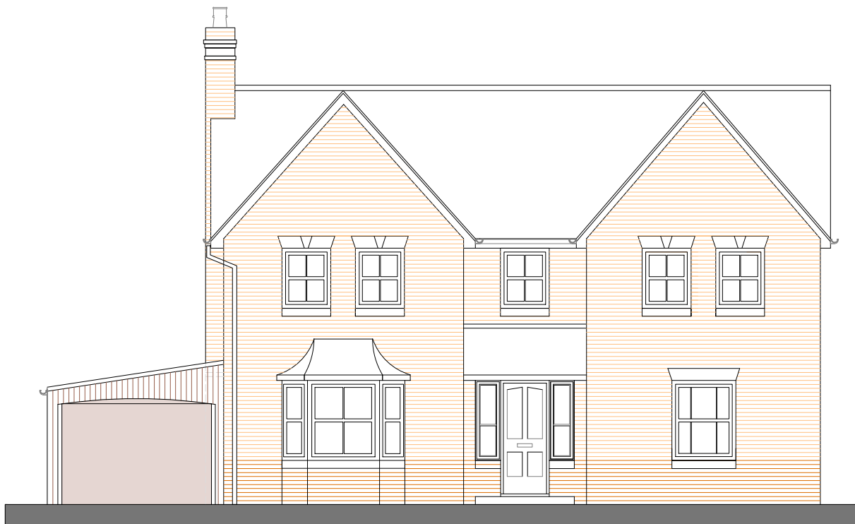
Existing Front North Elevation