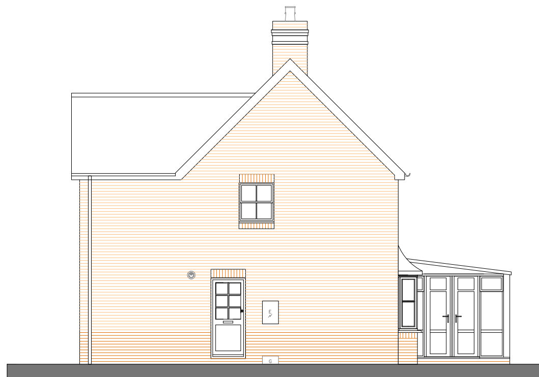
Existing Side West Elevation