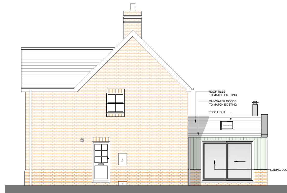
Proposed Side West Elevation