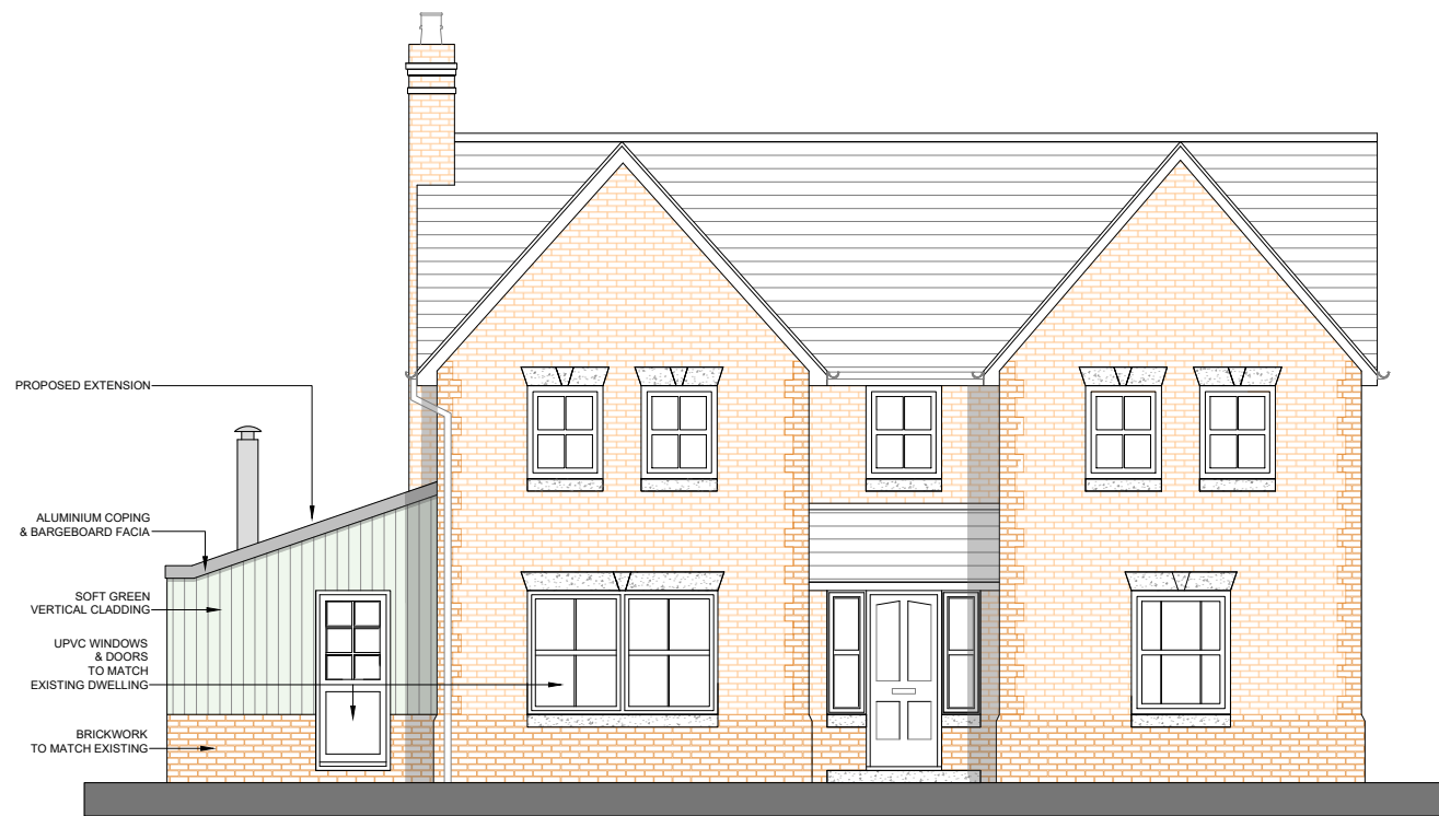
Proposed Front North Elevation