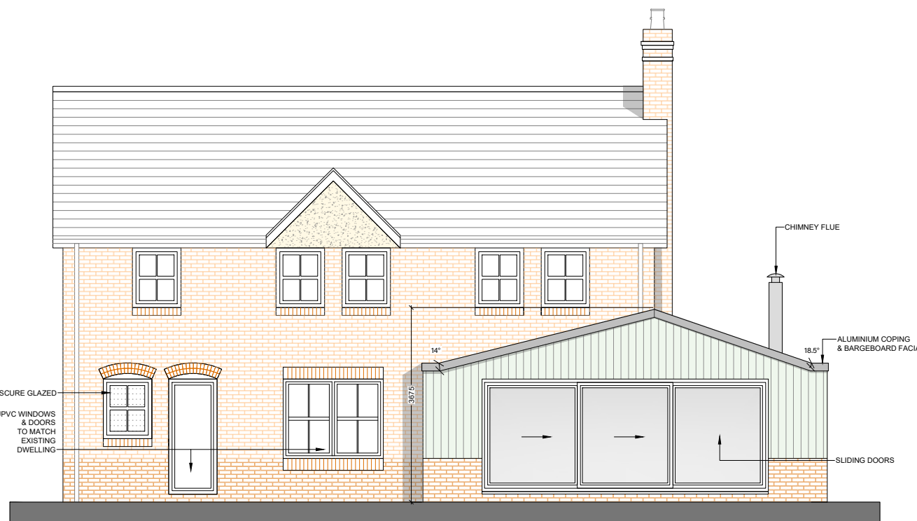
Proposed Rear South Elevation