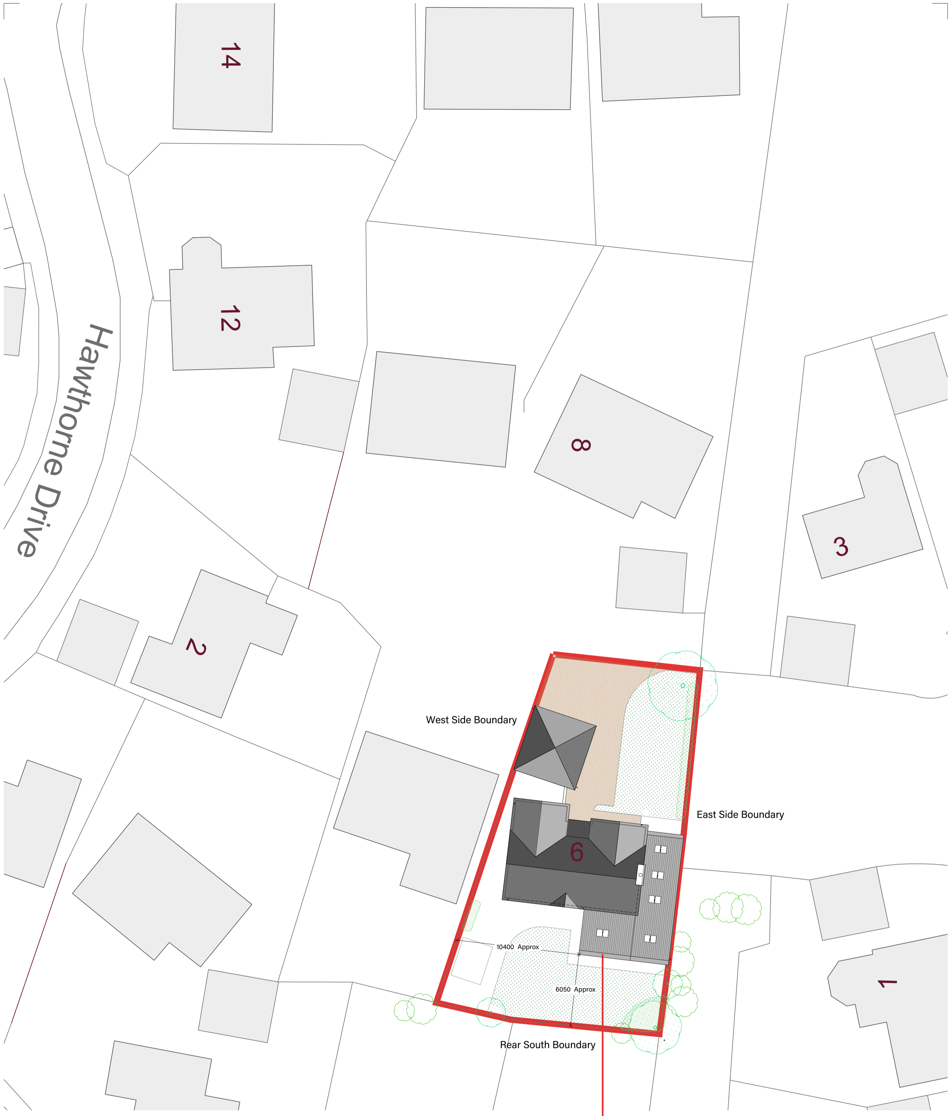
PROPOSED LAYOUT PLAN Total 47 sqm GIA