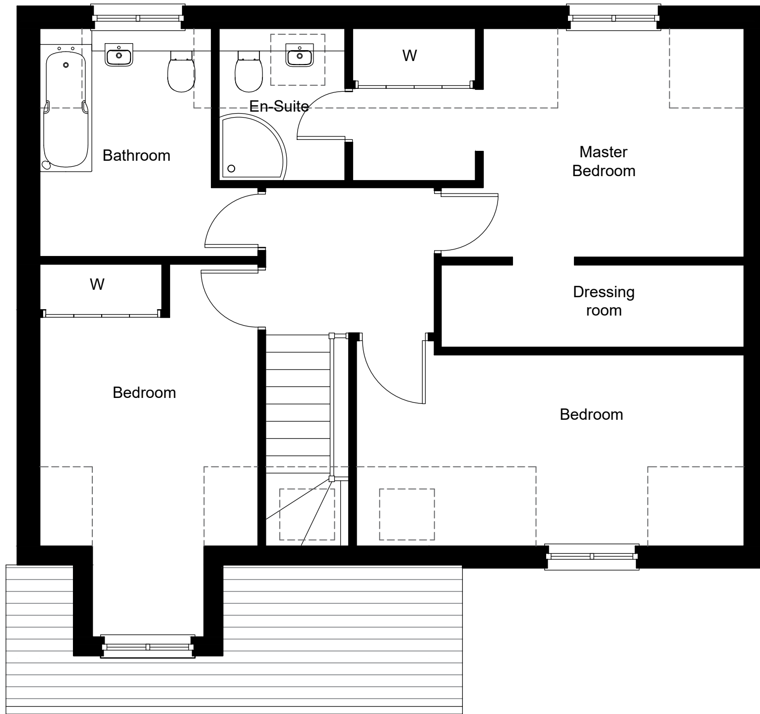
01 | First Floor Plan 1:50