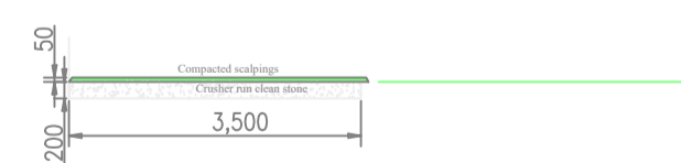
1:100 SECTIONAL ELEVATION

Lomond Consultants DEVELOPMENT CONSULTANTS PROJECT MANAGERS Walled Garden House Craigs Linlithgow EH49 6GF T: 07798647416 info@lomondconsultants.co.uk www.lomondconsultants.co.uk Project Title Access Roadway Northfield Stables & Livery Northfield Farm Longridge EH47 9AA Drawing Title: Block Plan STAGE: Planning SCALE: 1:500, 1:100 DATE: 25.10.23 DRAWN BY: IG DRAWING NO. 0945-PL-02