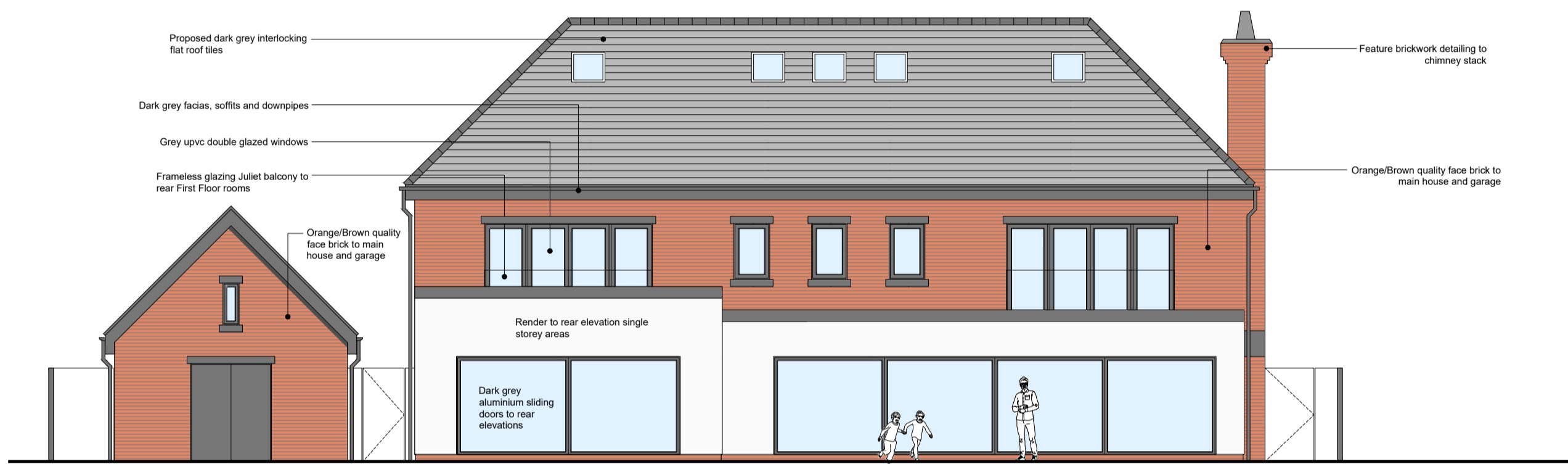
2 Proposed Rear Elevation Scale 1:100