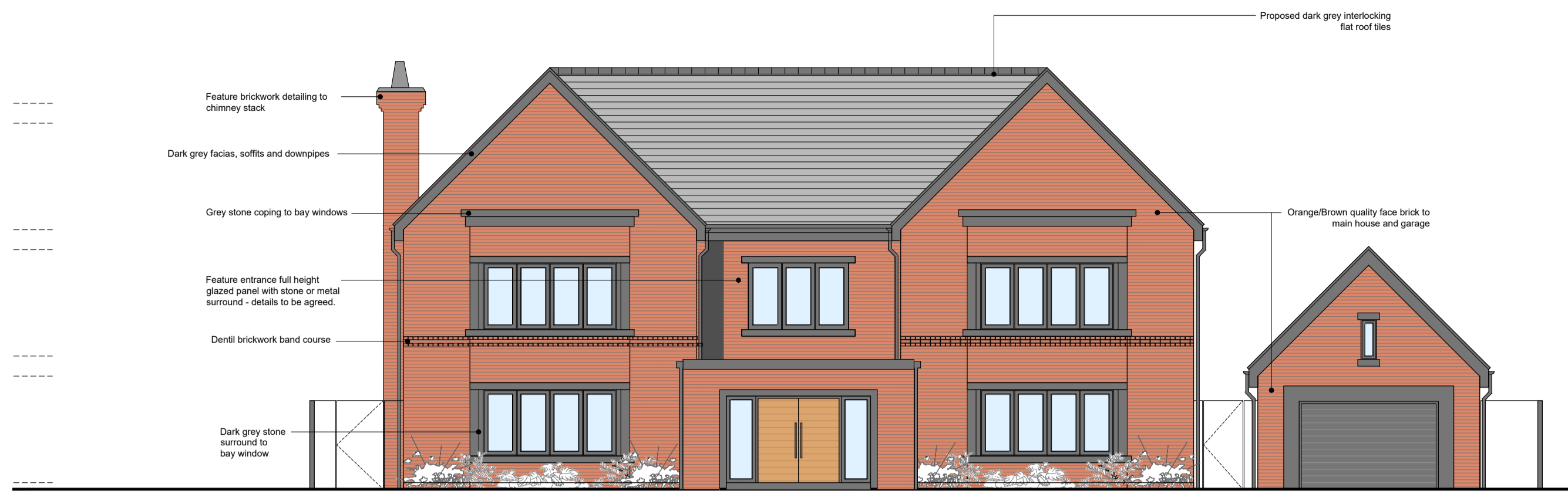
1 Proposed Front Elevation Scale 1:100