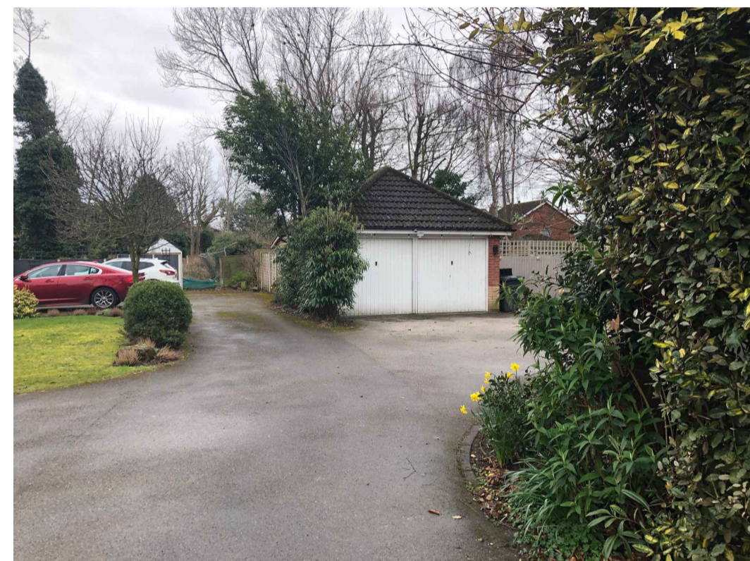
Photo 3 - Access Road looking towards the site entrance