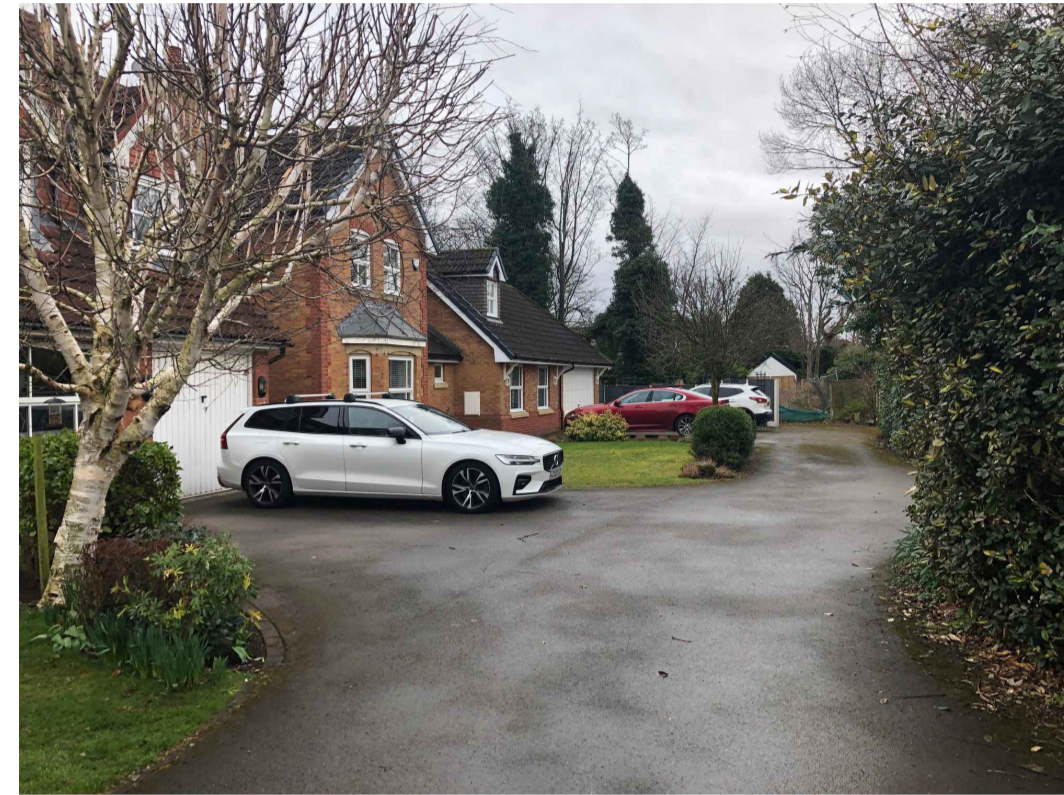
Photo 2 - Access Road looking towards the site entrance