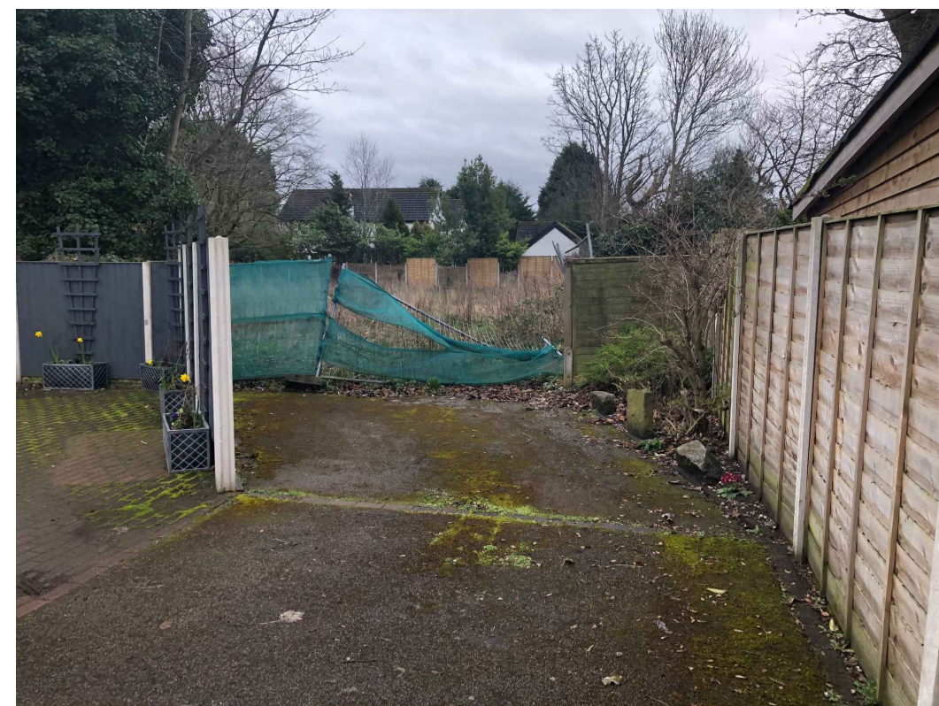
Photo 4 - View of current Site Access