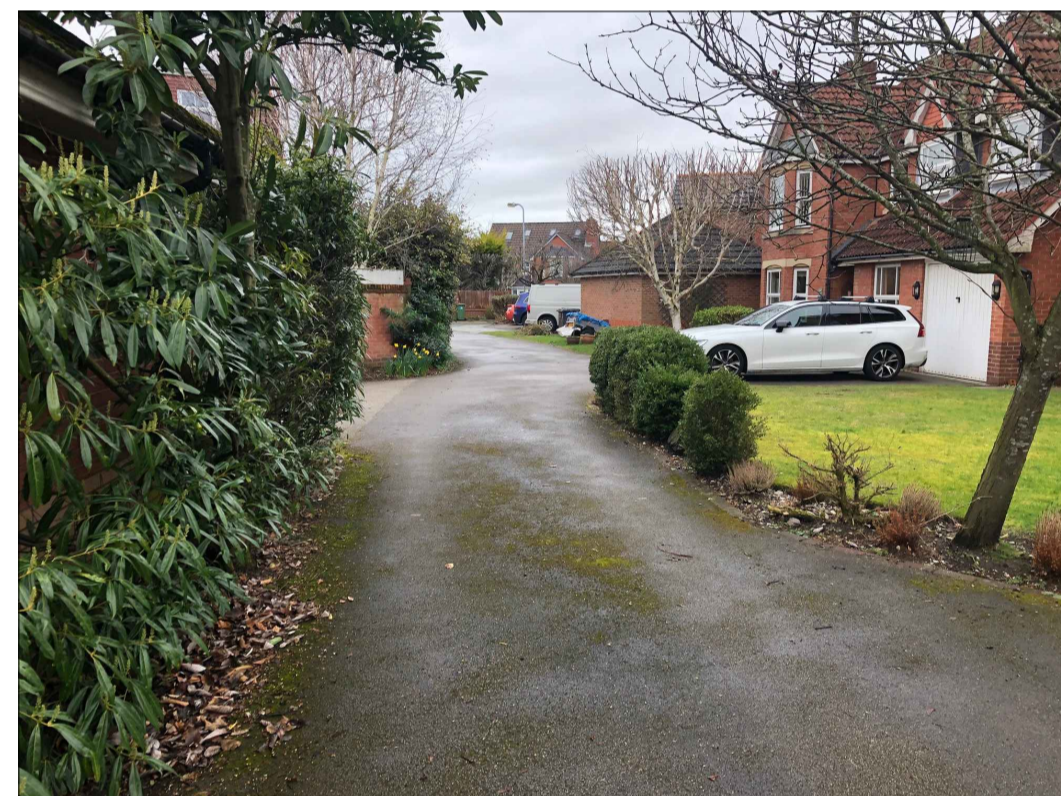
Photo 6 - Access Road looking towards the Adopted Highway