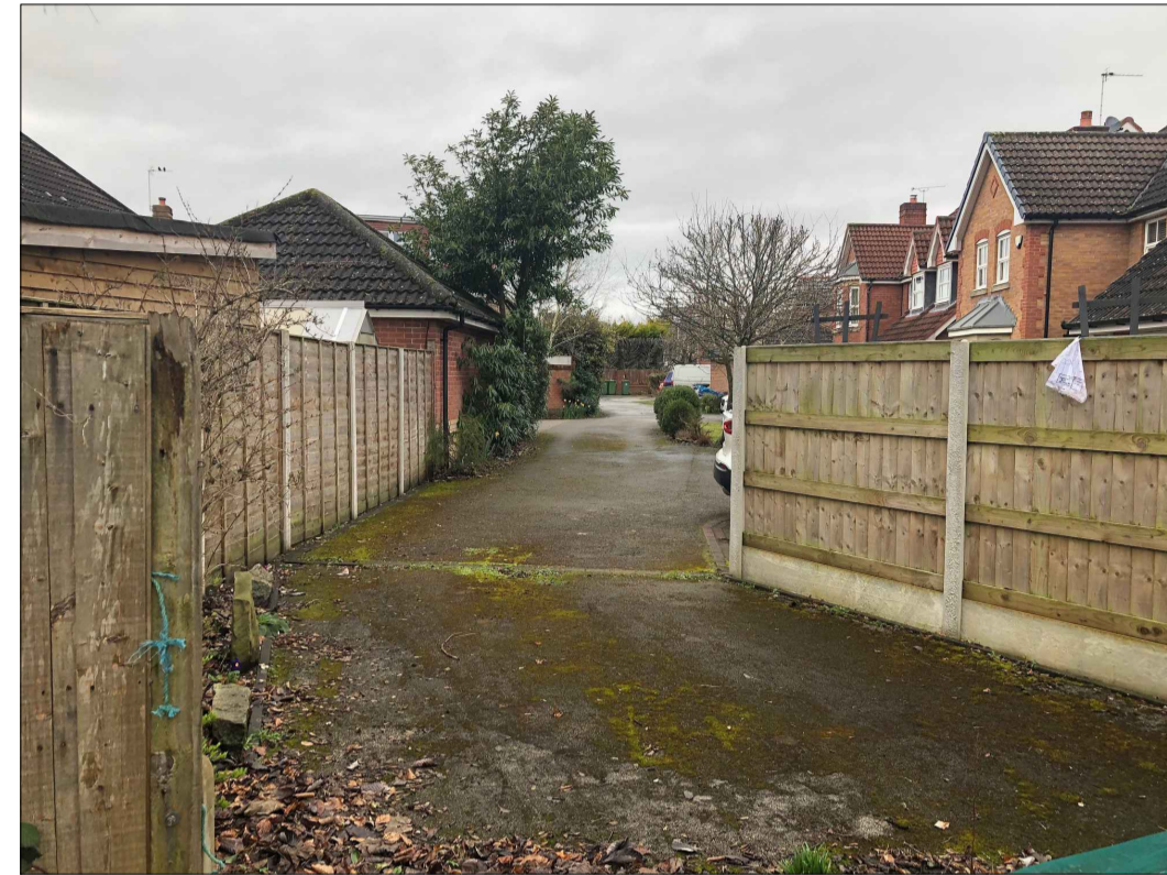
Photo 5 - Access Road looking towards the Adopted Highway