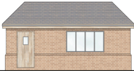
PROPOSED FRONT ELEVATION (EAST) Scale 1:100

Notes: Do Not Scale. Use only figured dimensions. All dimensions to be checked on site prior to construction. Any discrepancies to be notified to the architect. All Copyright Reserved to Haskins Designs Ltd