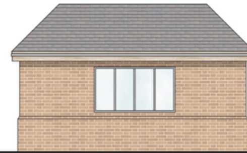
PROPOSED SIDE ELEVATION (SOUTH) Scale 1:100