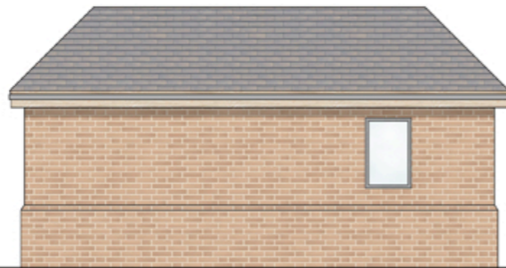
PROPOSED REAR ELEVATION (WEST) Scale 1:100