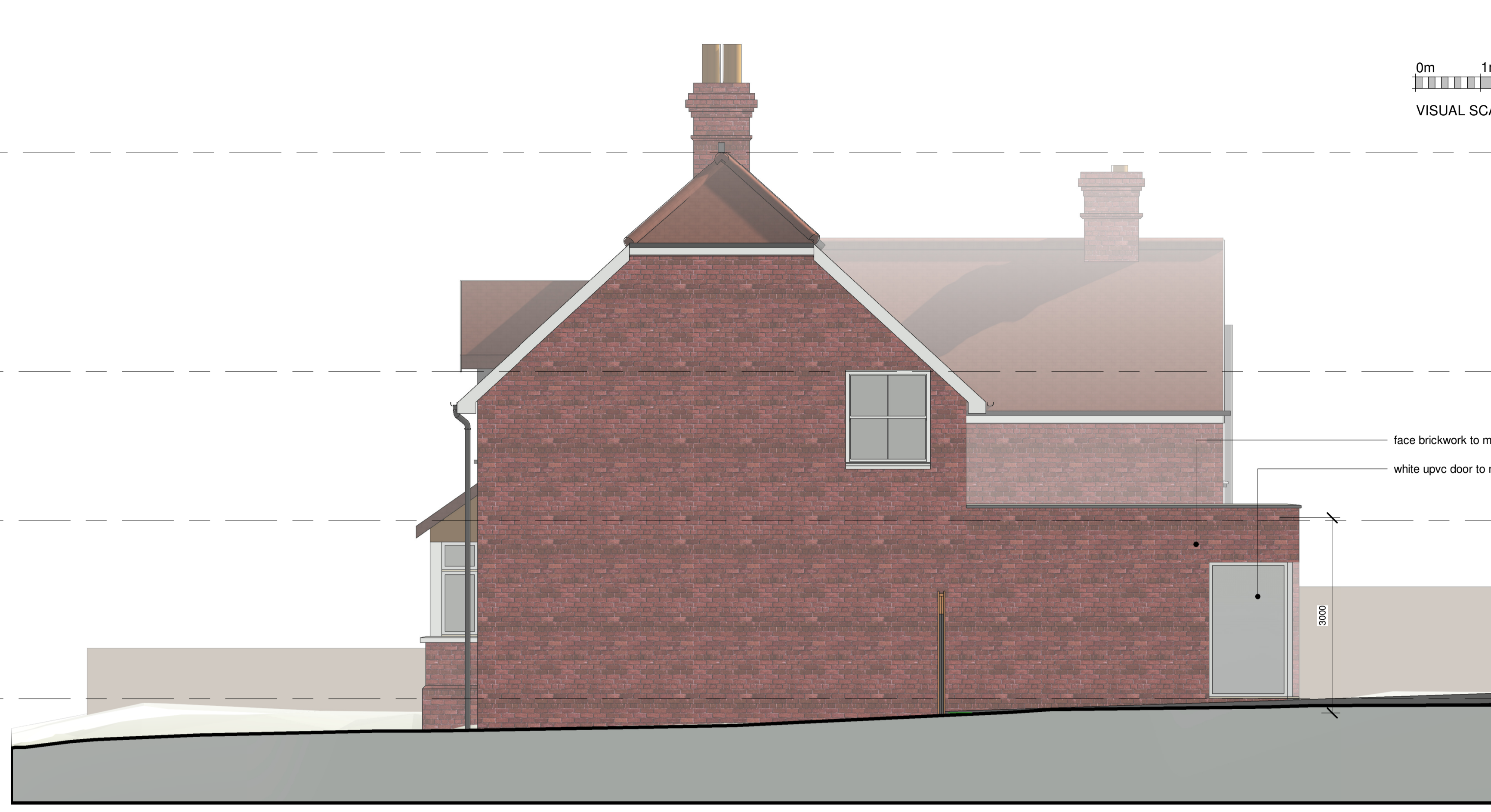
1 Front Elevation / Proposed 1 : 50

face brickwork to match existing white upvc door to match existing