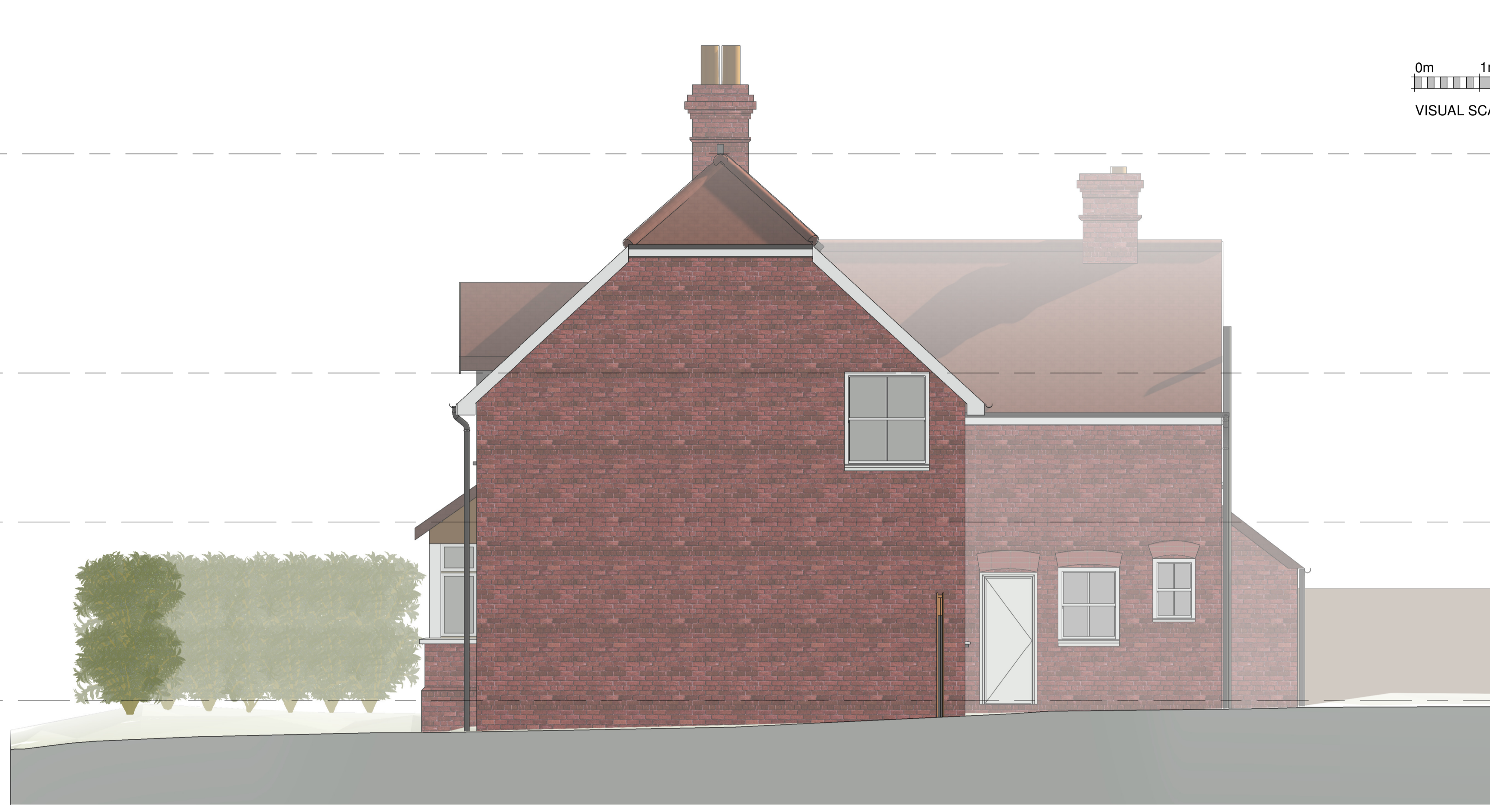
2 Side (North) Elevation / Existing 1 : 50