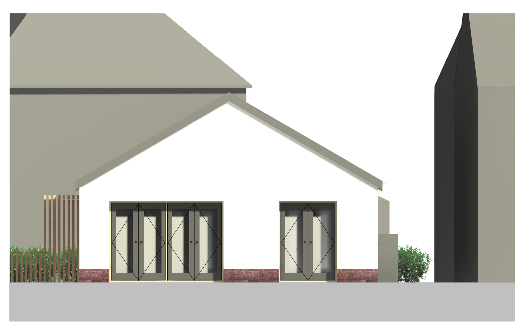
East 1 : 50