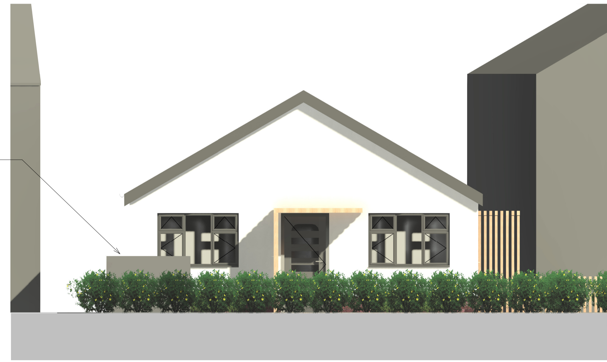
West 1 : 50 0m 1m 2m 3m 4m 5m VISUAL SCALE 1:50 @ A1