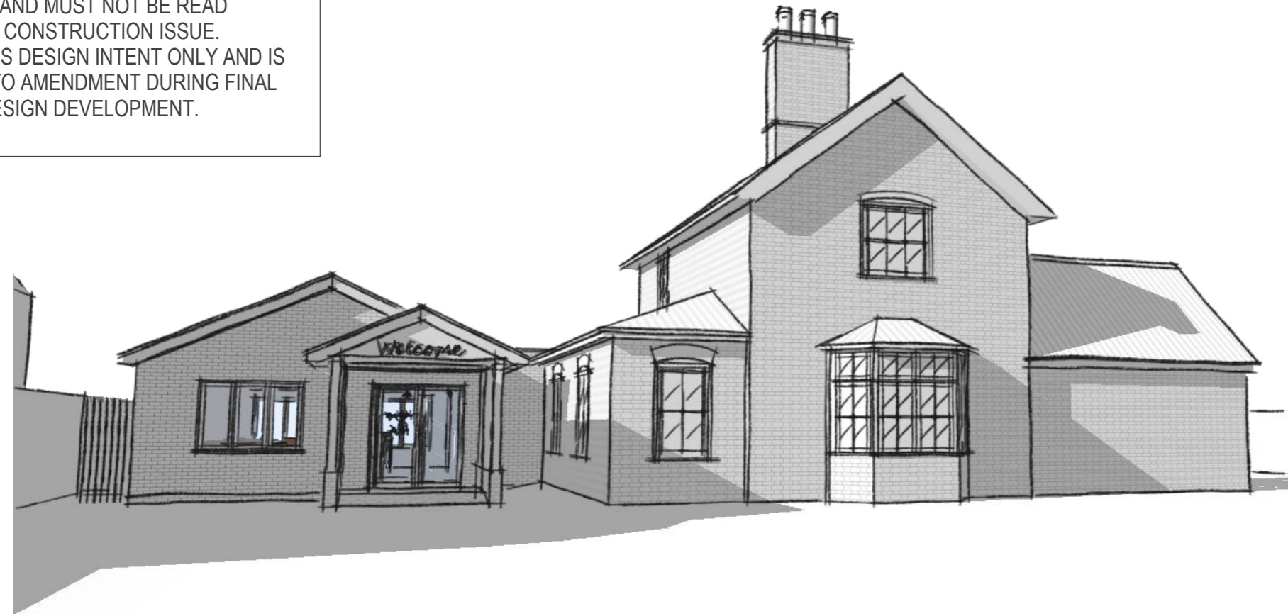
Proposed North-East Visualisation Not to Scale

All drawings are to be read with other relevant drawings & documents. Any discrepancies are to be reported to the Designer immediately. Do not scale information - ask. Drawing revisions marked with a 'P' are preliminary issue & should not be used for construction. All dimensions in metres unless stated otherwise