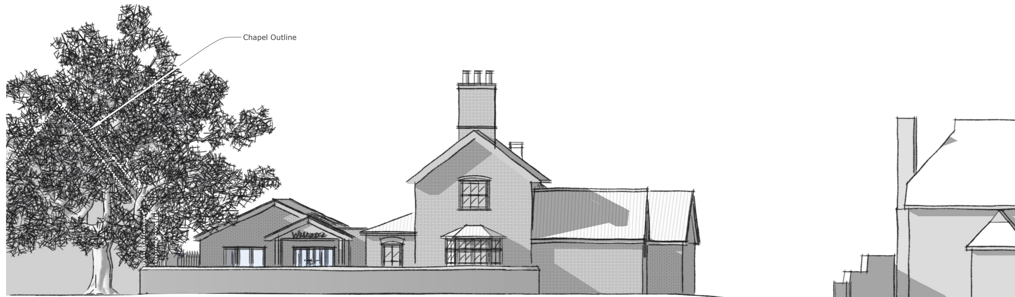
Proposed Street Scene Elevation (1:100)