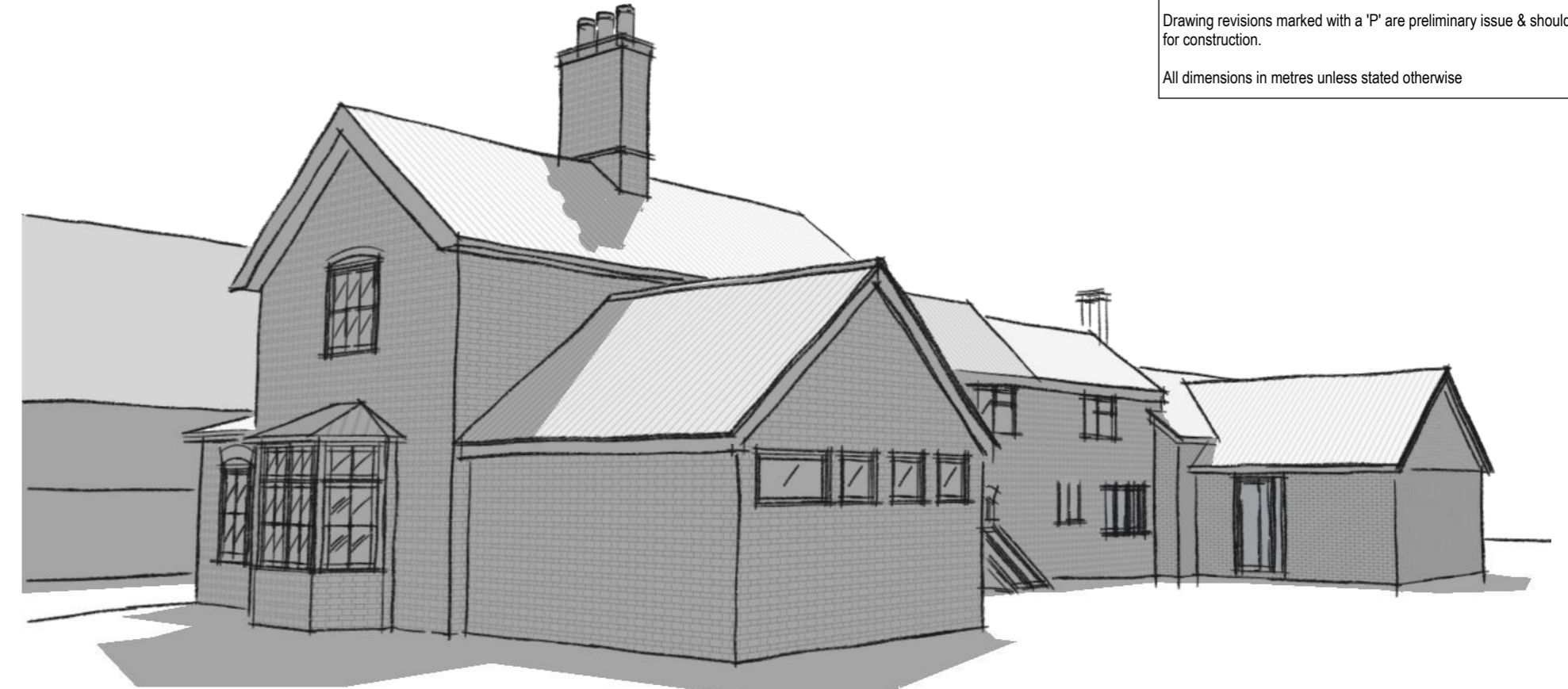
Proposed North-West Visualisation Not to Scale