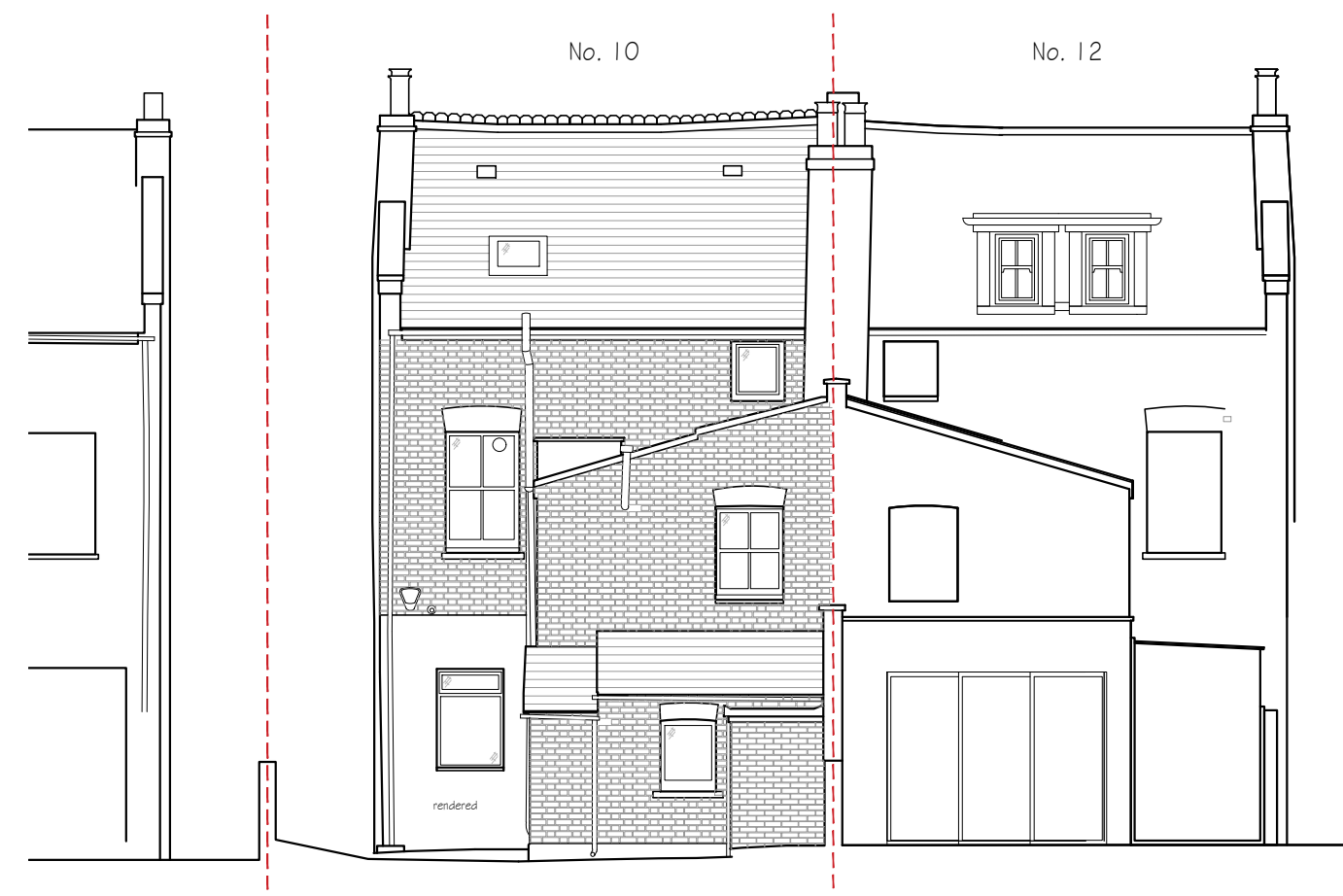
02 REAR ELEVATION D-05