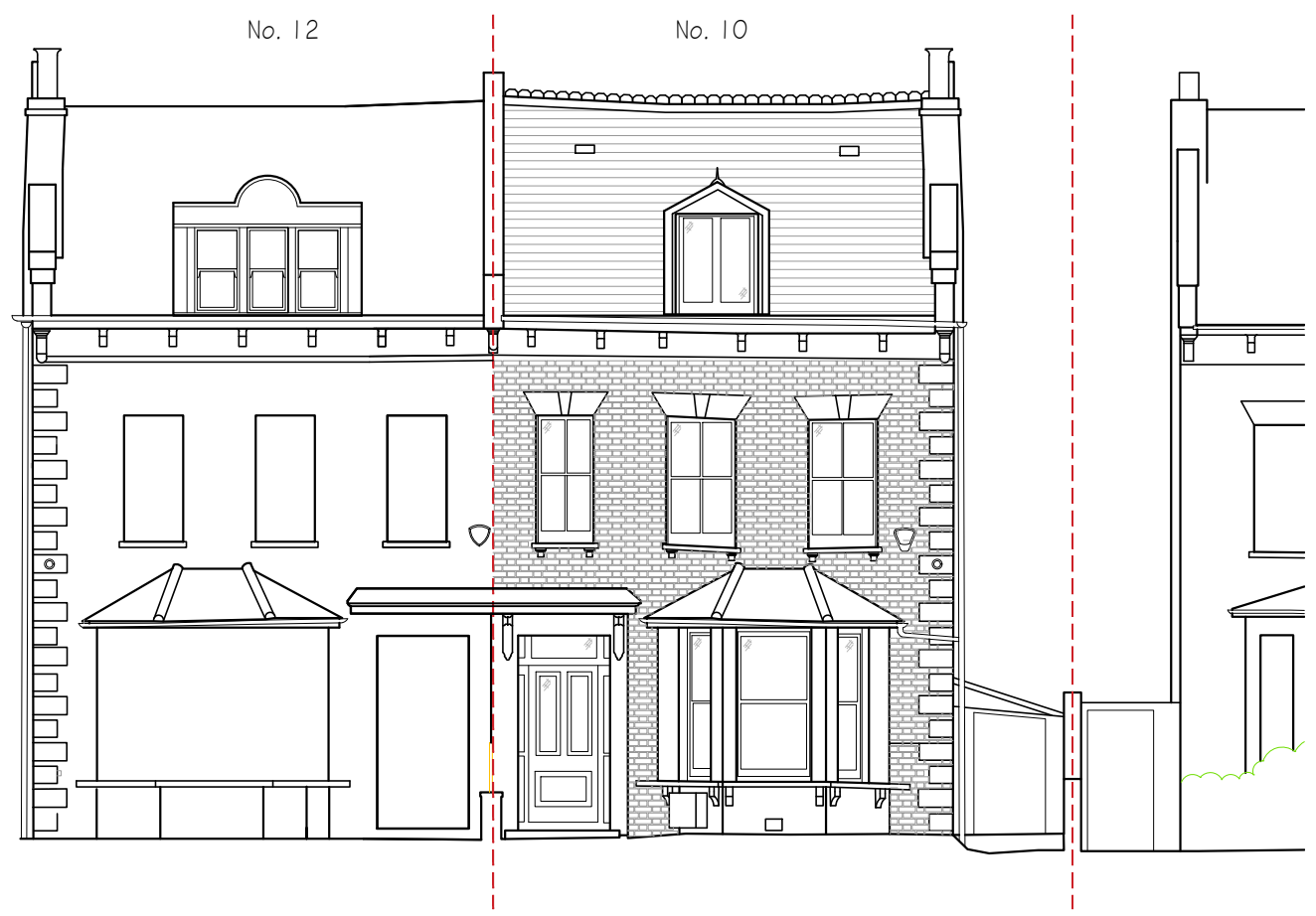
01 FRONT ELEVATION D-05