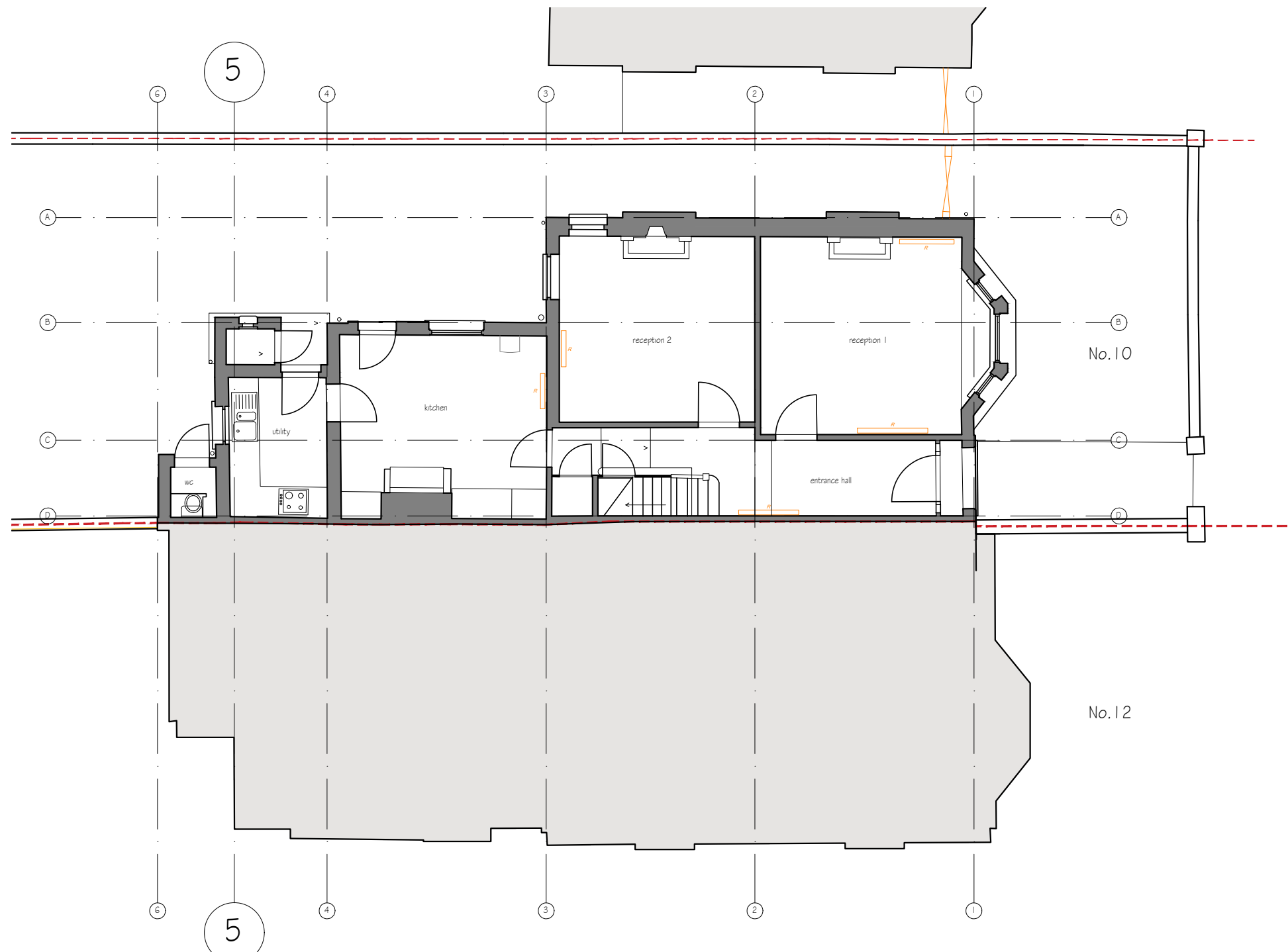
02 GROUND FLOOR PLAN