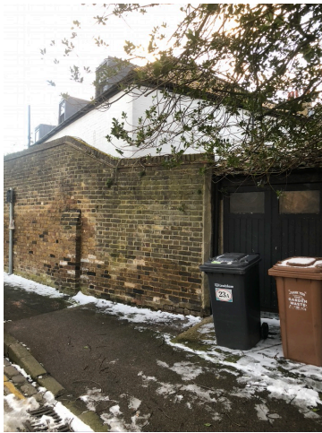
Picture showing heritage wall

This non-material application involves setting back the large lantern rooflight 3m away from the heritage wall shown in the picture below to allow for an internal up and over door mechanism. The amended lantern rooflight will also be made smaller. Please see drawings 011-014 which accompany this application.