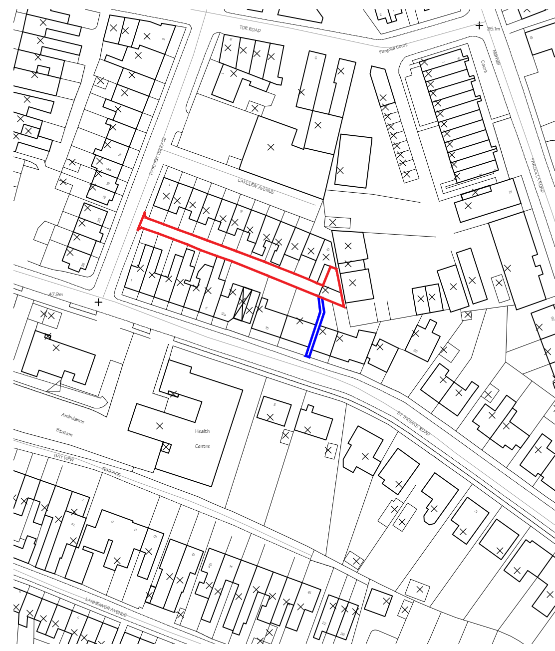
01 Location Plan 1:1250

GIVEN THE NATURE OF EXISTING BUILDINGS, ALL DIMENSIONS ARE TO BE DOUBLED CHECKED ON SITE PRIOR TO CONSTRUCTION / INSTALLATION / FABRICATION OF ANY BUILDING WORKS. DIMENSIONAL ACCURACY REMAINS THE RESPONSIBILITY OF THE CONTRACTOR.