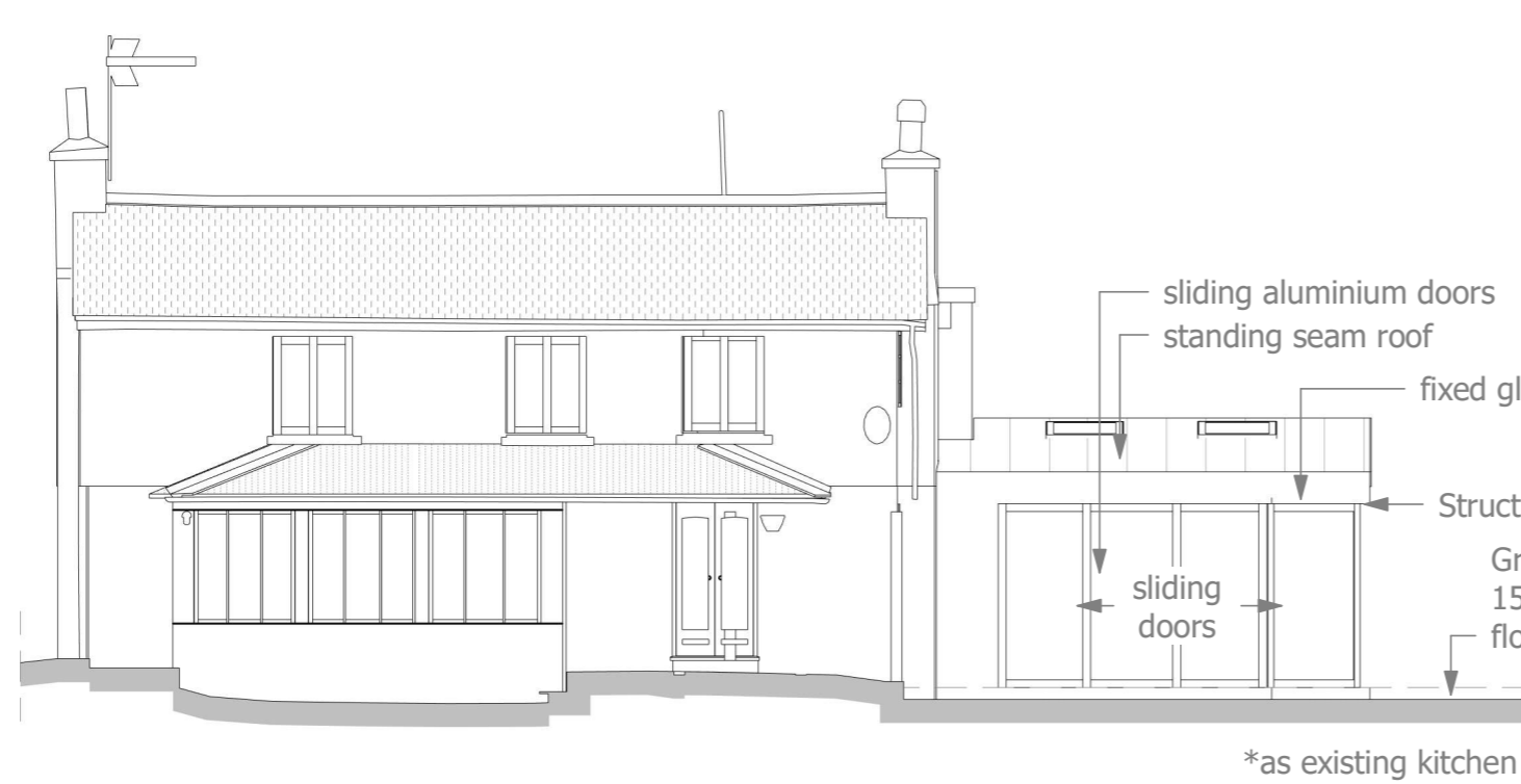
South Elevation as Proposed 1 : 100