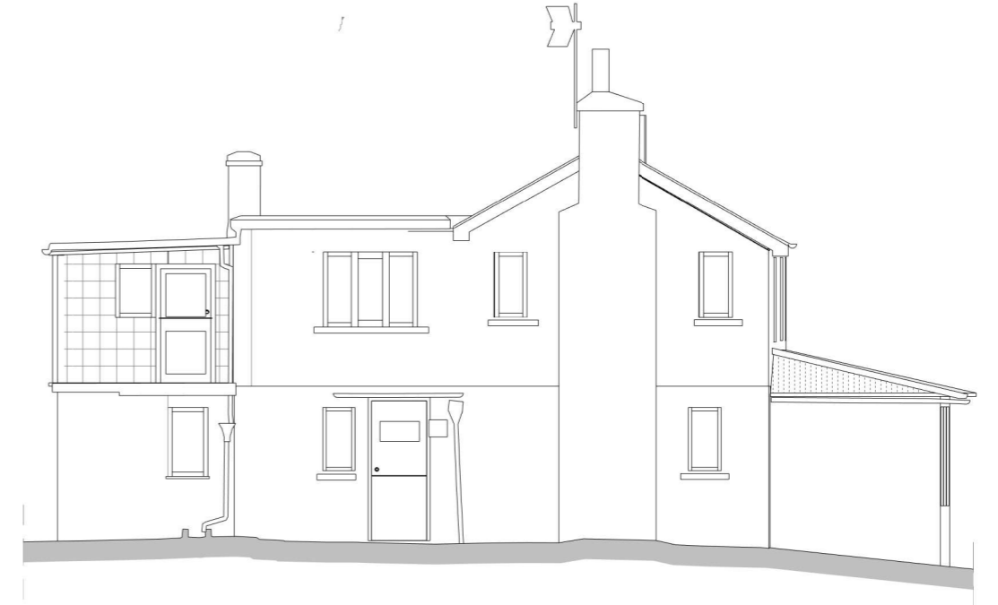
West Elevation as Proposed 1 : 100