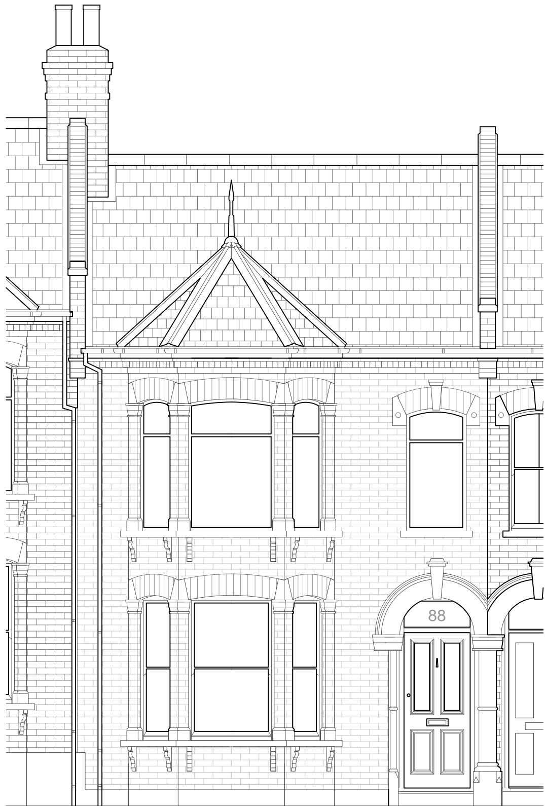
E EXISTING FRONT ELEVATION 01 SCALE 1/50