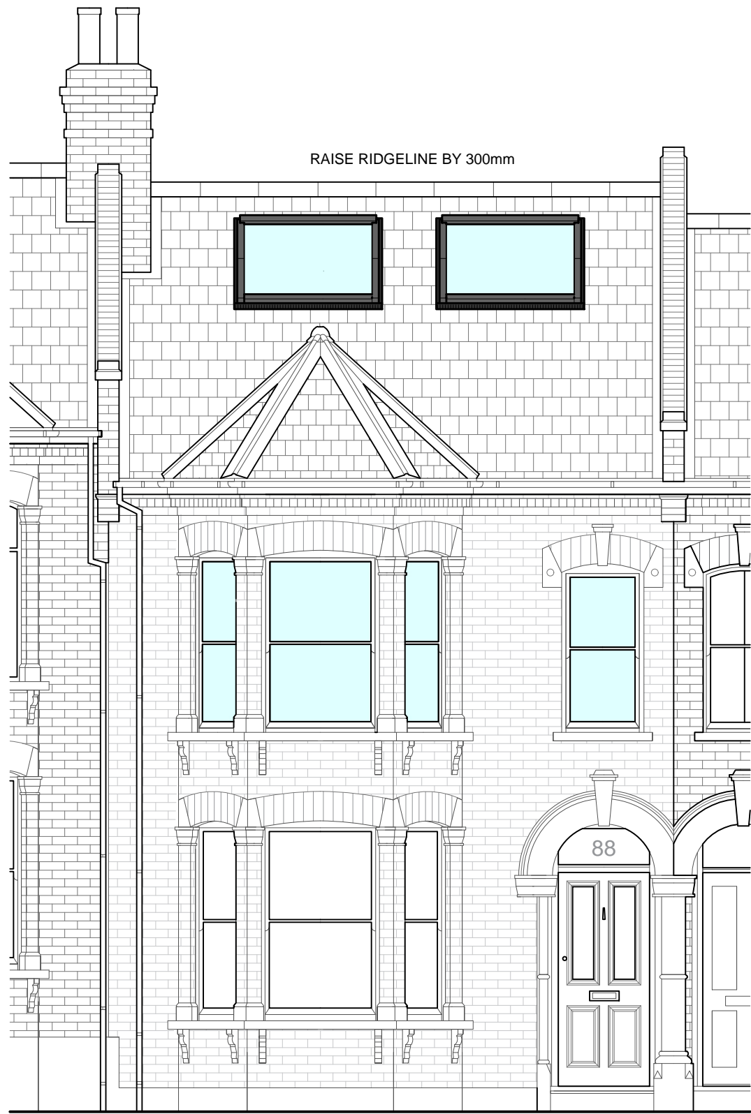
E PROPOSED FRONT ELEVATION 05 SCALE 1/50