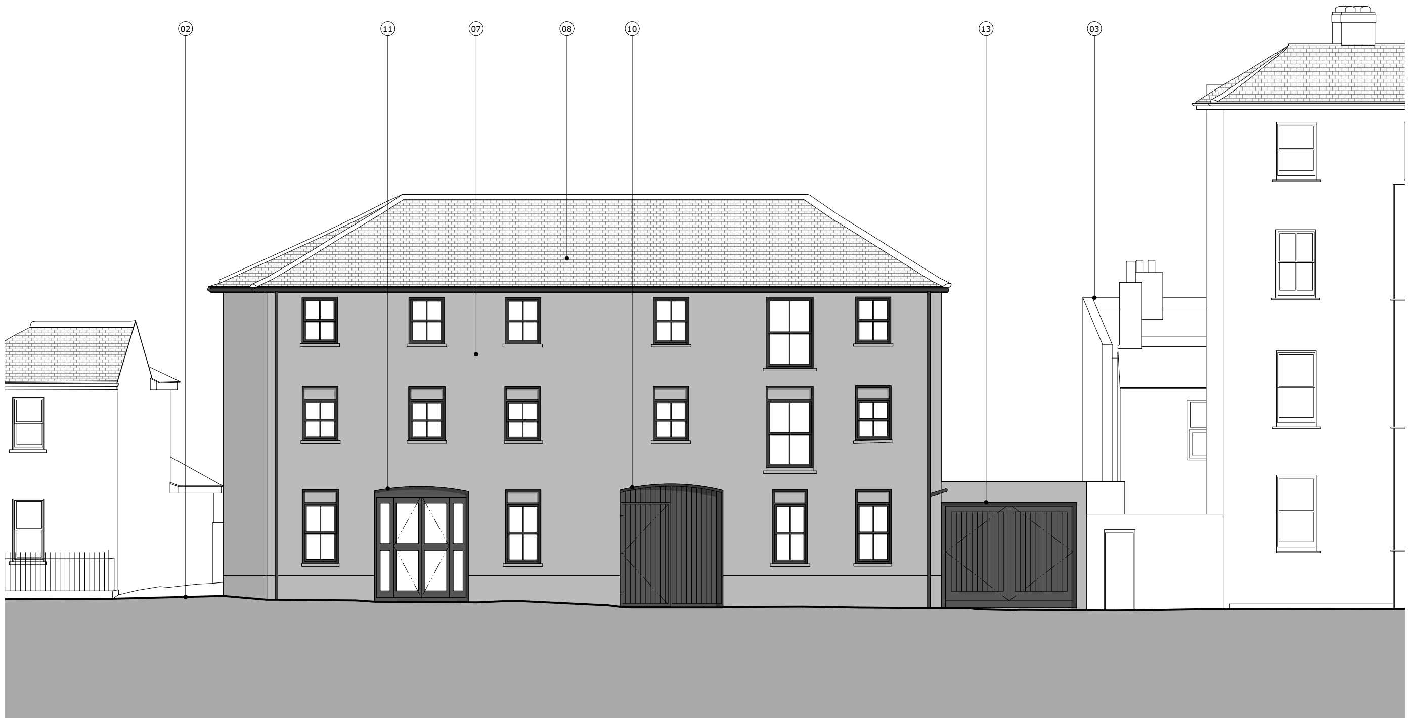
01 PROPOSED FRONT ELEVATION (SOUTH) 1:100