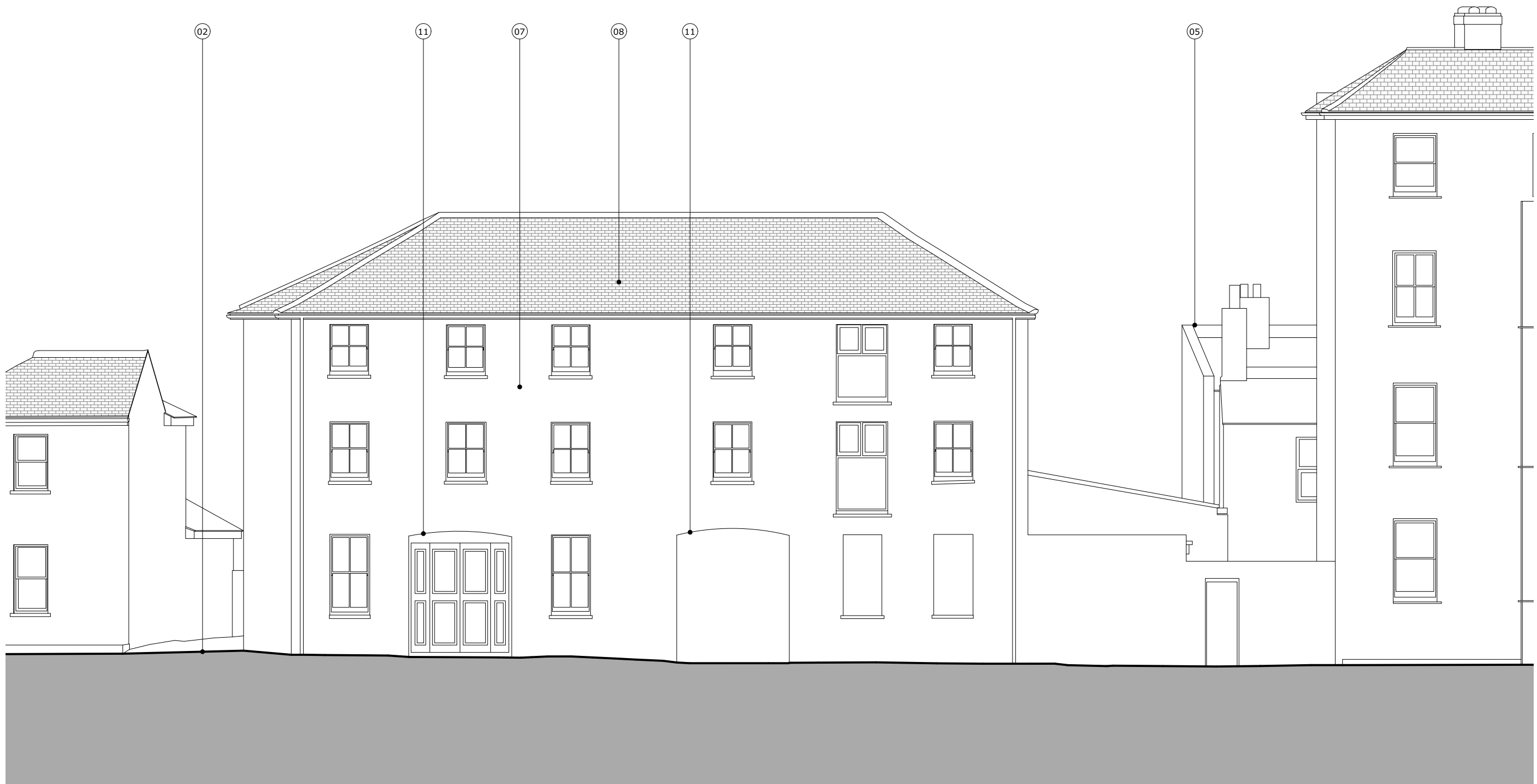
01 EXISTING FRONT ELEVATION (SOUTH) 1:100