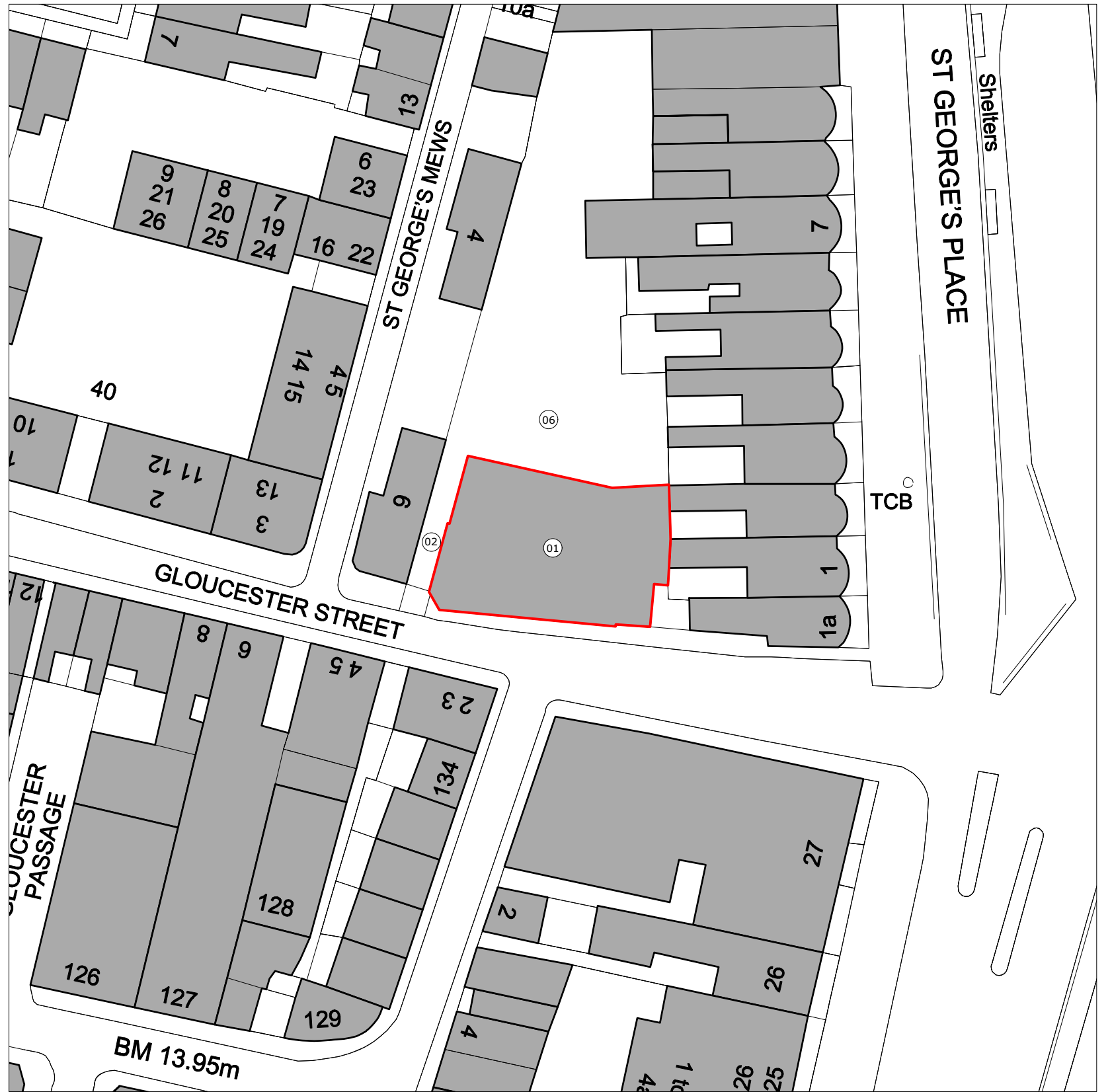
02 EXISTING SITE BLOCK PLAN 1:500