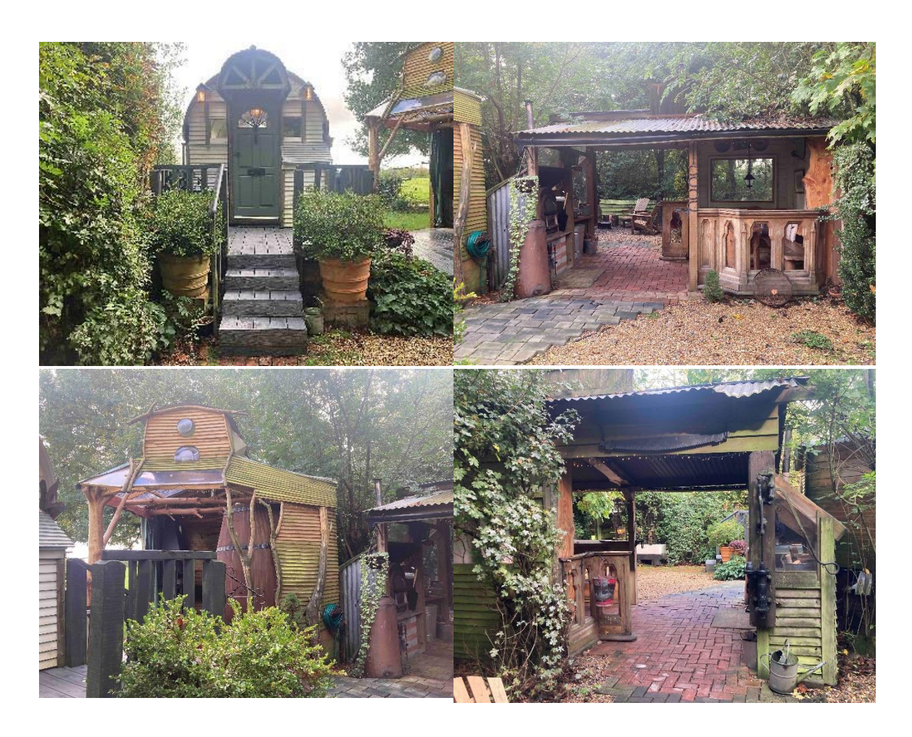
Figure 4: Wagon in the woods