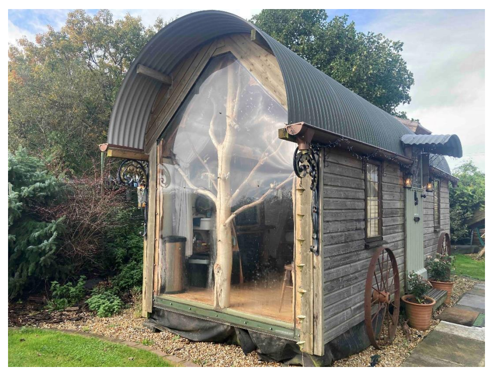
Figure 1: Wigwam and the Wagon