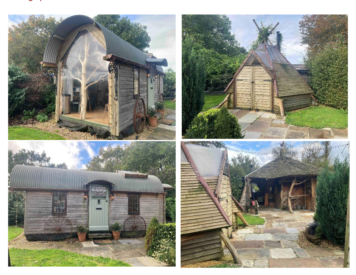
Figure 3: Wigwam and the Wagon