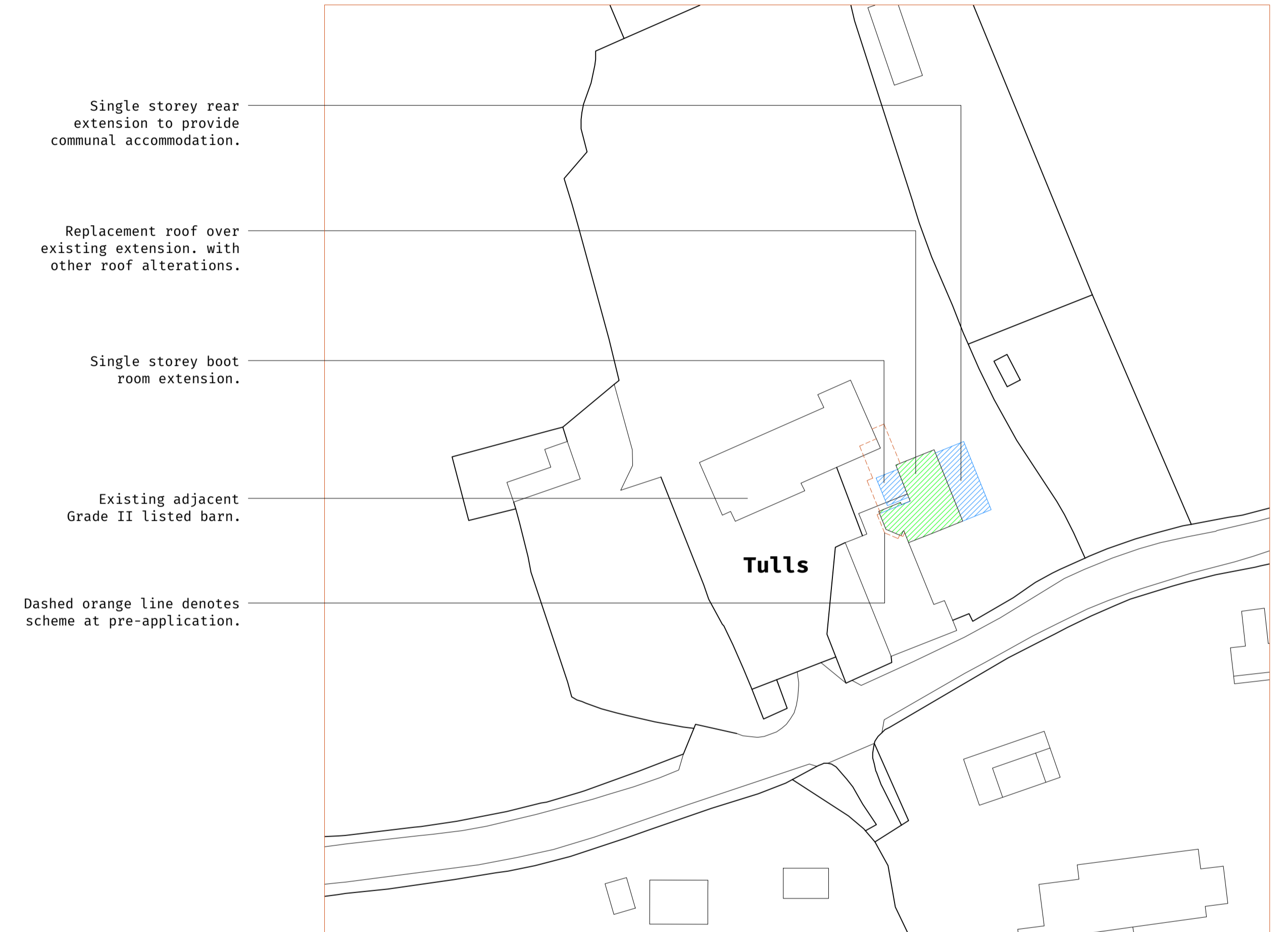
BLOCK PLAN @ 1:500