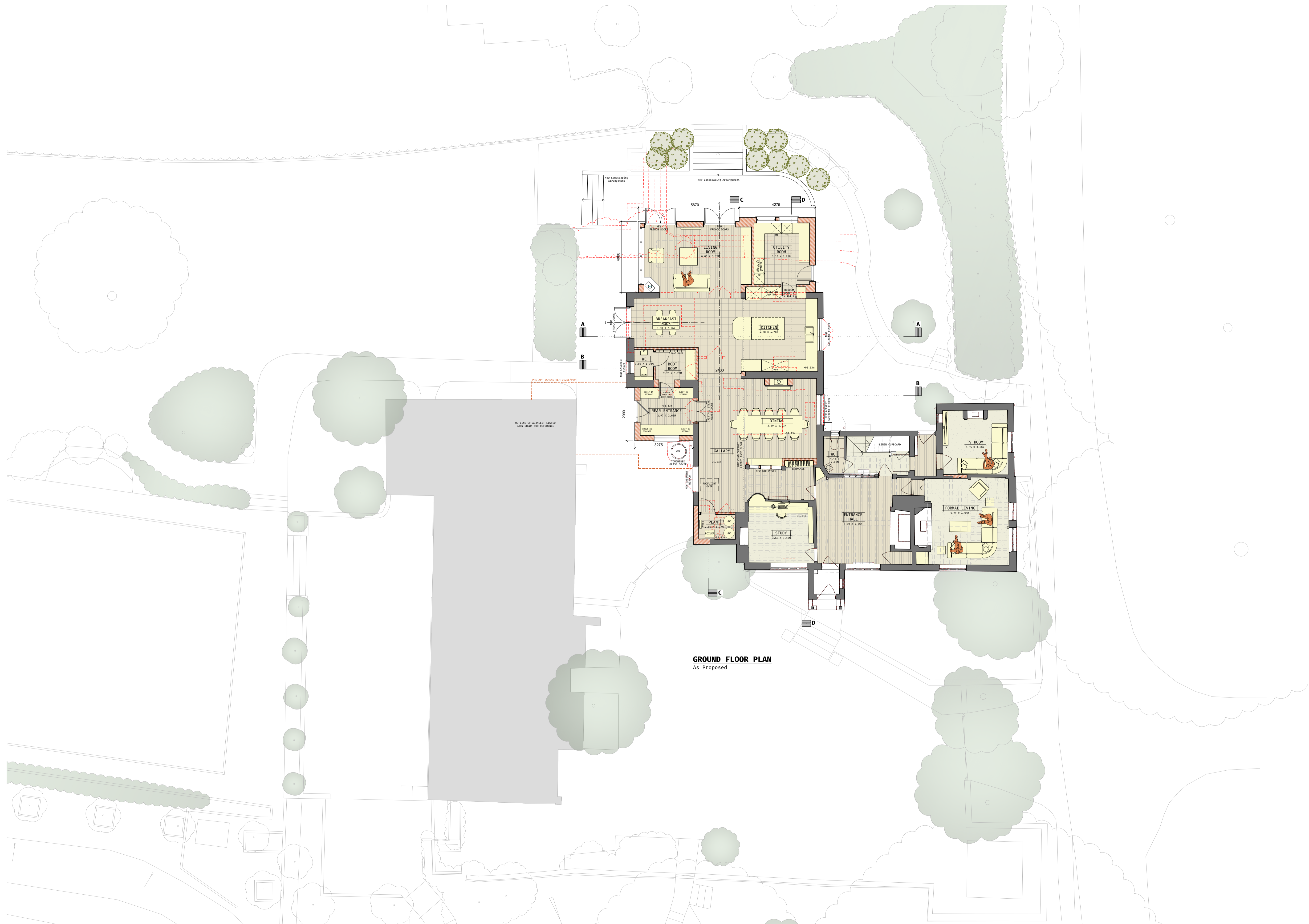
GROUND FLOOR PLAN As Proposed