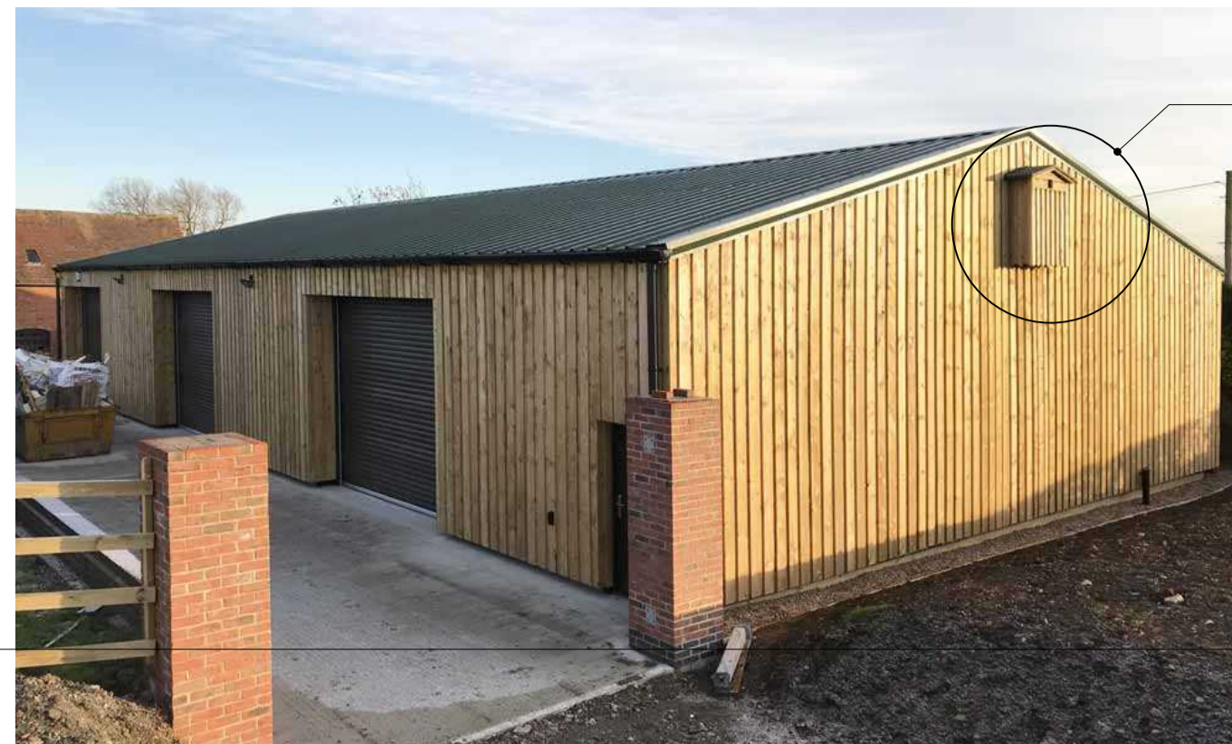
Proposed building type - for reference only.