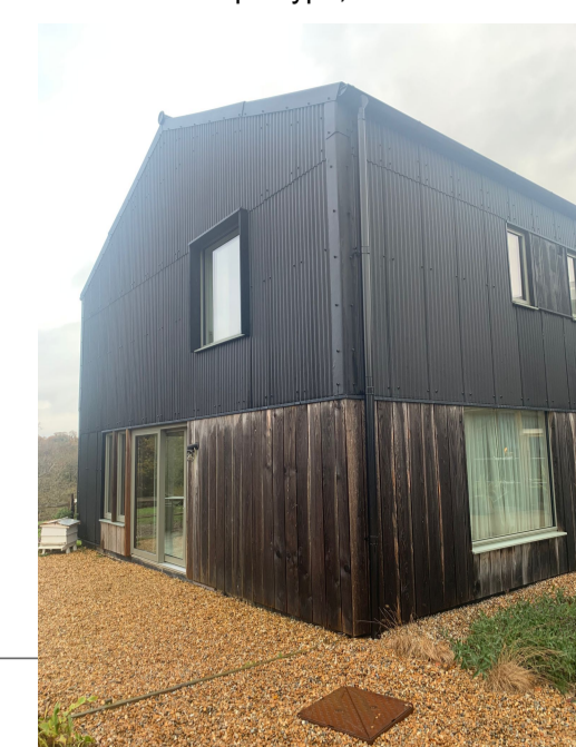
Image showing proposed cladding