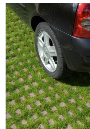
Grass guard permeable paving to unit hardstanding. Fully water permeable load bearing paving