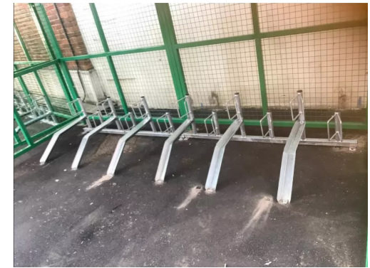
Two Tier Cycle Rack

Hinged and sliding steel doors with concealed locking system or similar.