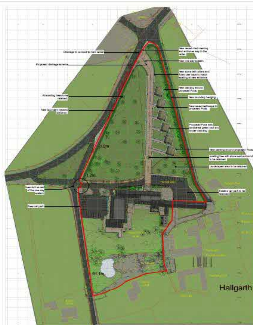
Proposed Site Layout - (1:1250)

timber windows and doors will be installed. This element of the proposed development will provide 2no visitor accommodation units.