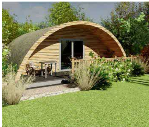
FIGURE 3.2: IMAGE OF PROPOSED LODGES