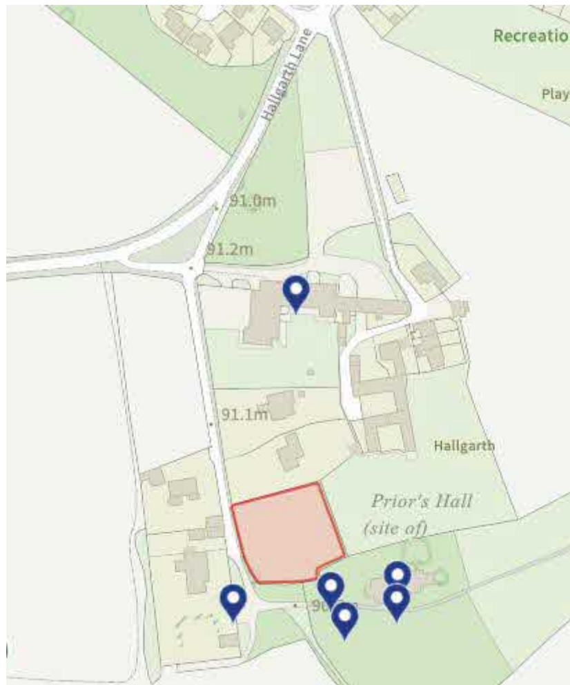
FIGURE 4.1: LISTED BUILDINGS / SCHEDULED MONUMENTS

4.14 The Listed Buildings potentially impacted by the proposed development are detailed below. Details of the Listed Buildings located in proximity to the Church of St Laurence are grouped together with the Church as a similar level of impact could be anticipated: