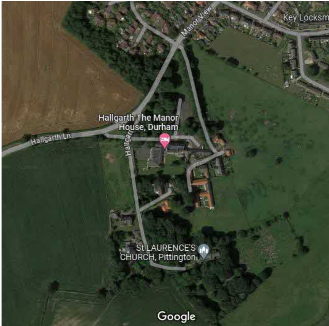
FIGURE 2.1: HALLGARTH MANOR AND IMMEDIATE SURROUNDING AREA.