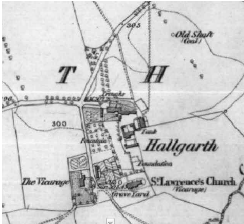
FIGURE 4.1: MAPPING FROM 1860