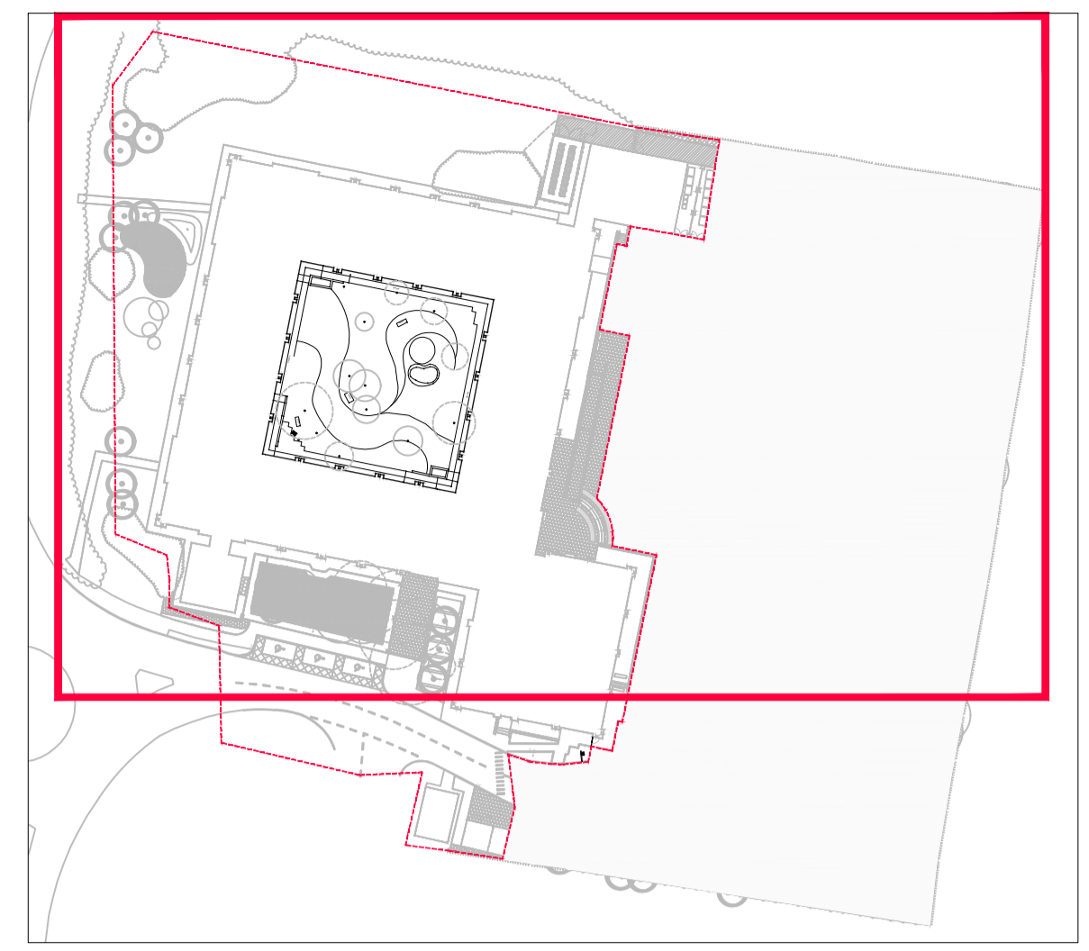
Site Location Plan - Scale: 1:1000

The use of drawings by the Customer acts as an agreement to the following statements. The Customer must not use the drawings if it does not agree with any of the following statements: All drawings are based upon site information supplied by third parties and as such their accuracy cannot be guaranteed. All features are approximate and subject to clarification by a detailed topographical survey, statutory service enquiries and confirmation of the legal boundaries. Do not scale the drawings. Figured dimensions must be used in all cases. All dimensions must be checked on site. Any discrepancies must be reported in writing to Colour:UDI, before proceeding. All drawings are copyright protected. Refer to full Terms & Conditions at www.colour-udi.com