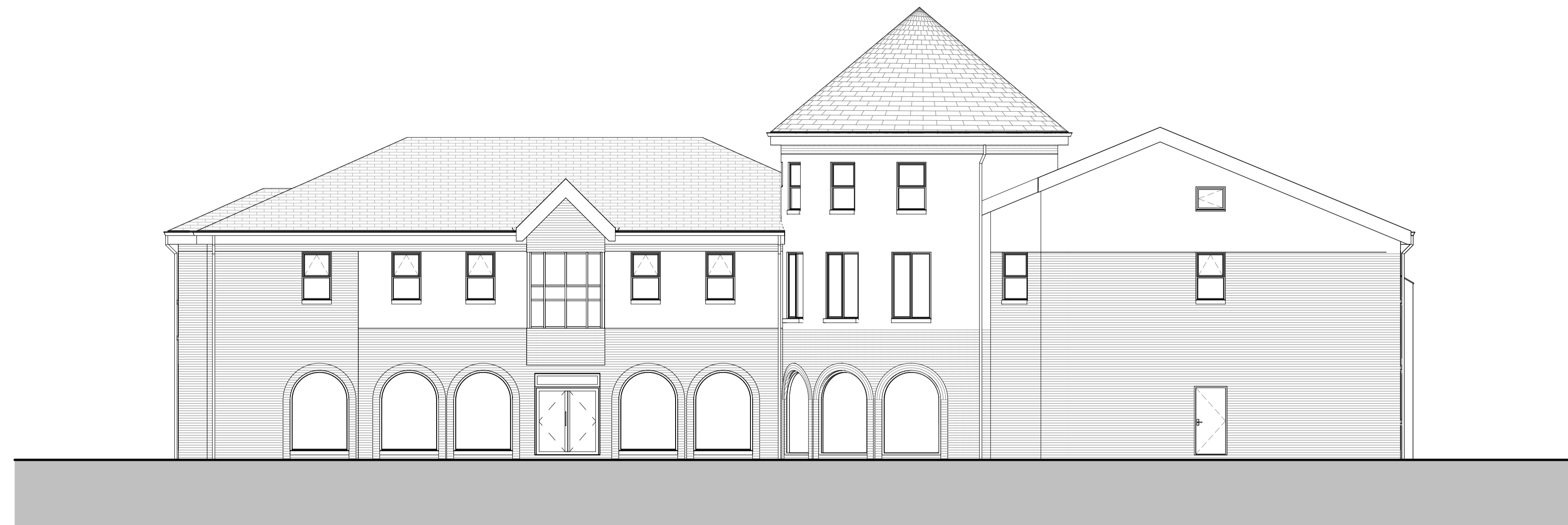
1 Elevation 2 Existing 1 : 100